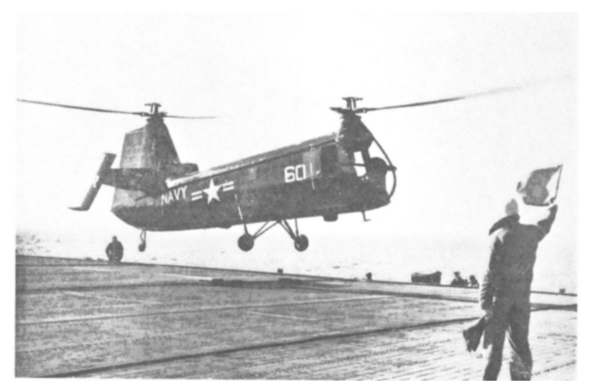
Fig 4 US Navy HUP-1 Utility Helicopter Plasecki Helicopter Corp

Land mine-fields can be traversed and opened by the use of helicopters equipped with devices for towing across the ground