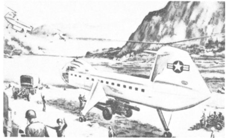
Fig 5

The attack functions of the helicopter may be broadly divided into carrying assault troops and weapons directly to the scene of attack, rapid redeployment of troops as the course of battle may require, and directly attacking tanks or emplacements with rockets and other weapons