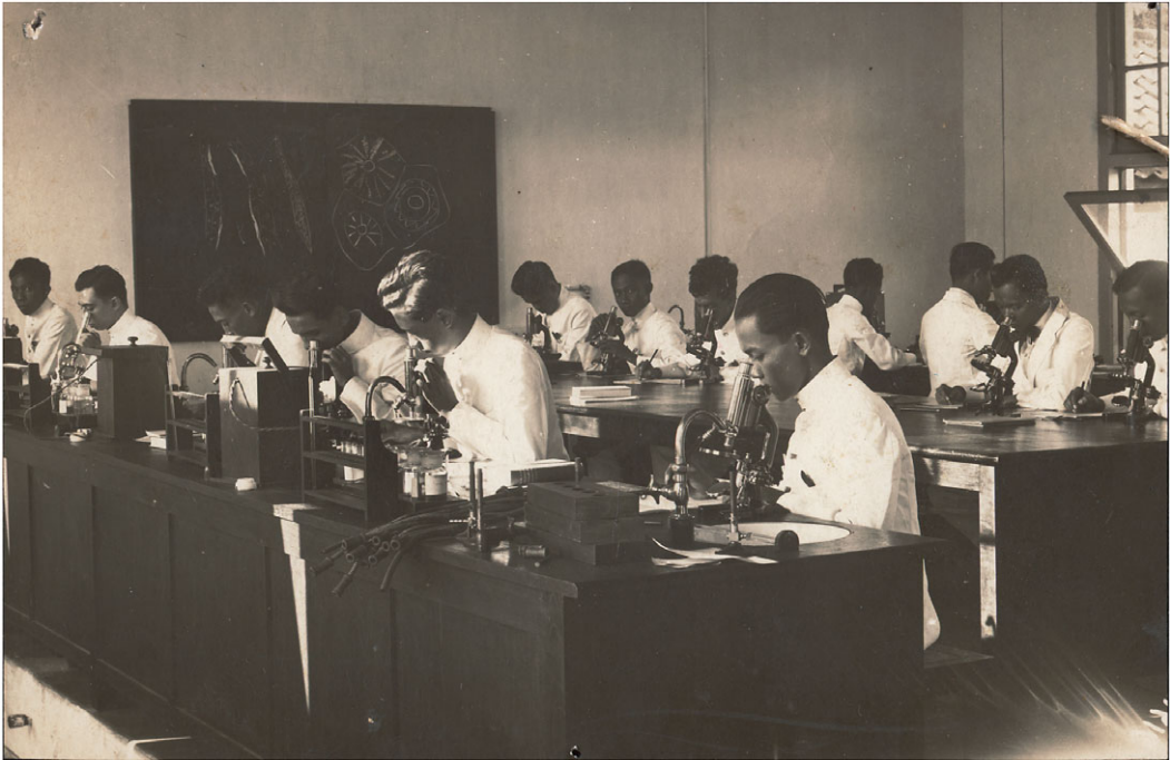
Image 4. Practical instruction in microscopy at the STOVIA in 1924 when it had relocated to the new medical school building.

there was 'too little practical laboratory teaching' (Image 4). 31 According to him, there was not enough laboratory equipment available to make more laboratory-based teaching feasible. He was nonetheless impressed with the new teaching facilities.