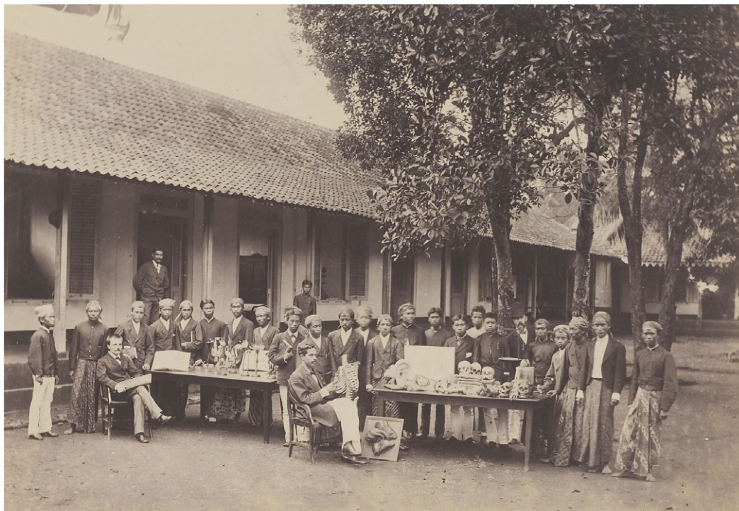
Image 1. Students and instructors of the Dokter Djawa school in 1880. This image gives a good indication of the teaching material that was used in the medical course of study, which included several skulls and bones, an incomplete skeleton, models of organs (such as the large model of the human ear) and illustrations. Image from Dokters-Djawa School, Batavia, 1880 . Image made available by Leiden University, KITLV 5185.

lit. dressage] natives to perform as dokter djawas '. 12 This critic argued that, because of the limited intelligence of the 'natives', the medical college merely trained indigenous young men to perform a few practical tasks which did not require any comprehension of medical science. The instructors at the Dokter Djawa school were medical officers with many other responsibilities; they were unable to spend much time on instruction. In addition, they were transferred frequently, which led to regular changes in teaching personnel and approaches to medical education. There were other reasons that conditions at the school were less than ideal. Teaching equipment was scarce. Instruction in anatomy, for example, was perfunctory and relied on large anatomical illustrations, a few paper maché models and some human bones (Image 1). In 1871, a request was submitted to acquire 'a skeleton, various loose bones, [and] a cracked skull'. 13 In 1877, a retiring medical officer sold a skeleton to the school. It was equipped 'with copper hinges and springs, so that all normal movements can be executed'. In addition, 'the origin and attachment of all muscles are indicated by colours and printed instructions'. 14