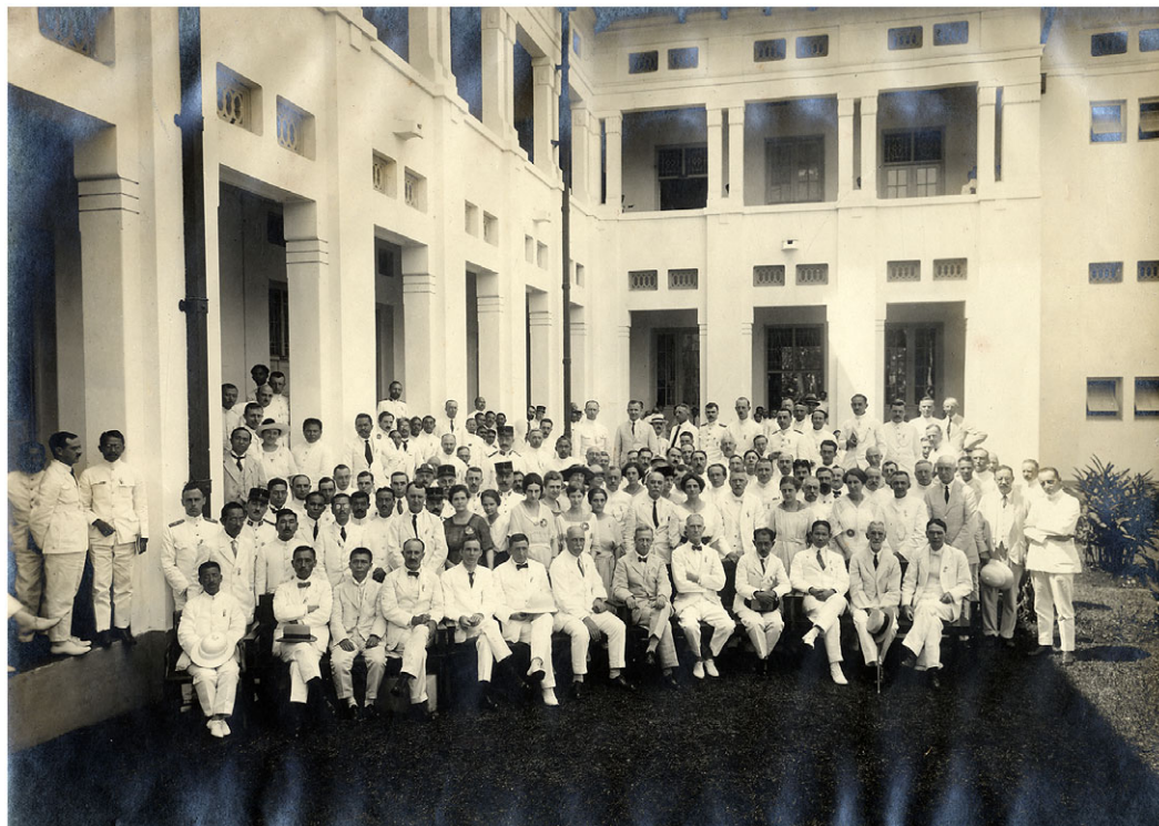
Image 3. The fourth Congress of the Far Eastern Association of Tropical Medicine, held in August 1921 at the new premises of the STOVIA, indicating the pride leading physicians and the colonial administration took in the new building. From 1927 on, these premises housed the Batavia Medical School ( Geneeskundige Hoogeschool ). Image made available through the Leiden University library, KITLV 68926.