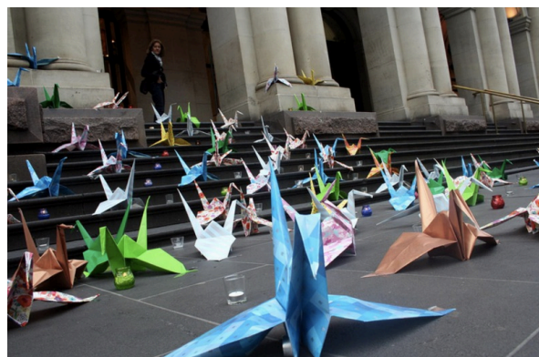
Figure 1: Flock of origami cranes at vigil for Fukushima, March 2011, Melbourne. 19

The "3/11" compound disaster also galvanised expatriate Japanese communities and their supporters. As soon as the terrible news of the disaster came through, vigils were held in capital cities and regional centres across Australia. In Melbourne, for example, a vigil was held in the city centre on the evening of 17 March 2011, on the steps of the former General Post Office Building. The steps were decorated with a flock of giant origami cranes and rows of candles. Every March since then, commemorative events have been held on each anniversary. Given the close connections between the issue of nuclear irradiation at Fukushima and at Hiroshima and Nagasaki, Fukushima is remembered once again every August on Hiroshima Day and Nagasaki Day. There is now an annual rhythm of events in March and August. At each event the connections between these historical events have been explored in more detail and with more subtlety. By an iterative effect, Hiroshima and Nagasaki are constantly being re-remembered, but now through the prism of Fukushima. The organisations that hold these events have built up a repertoire of symbols and practices which carry over from event to event and from year to year, as we shall see below.