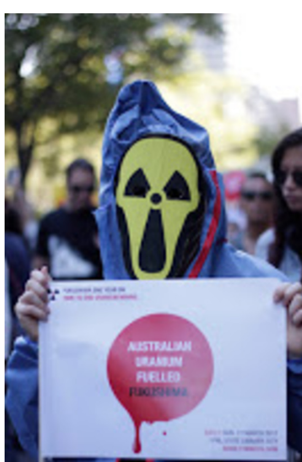
Figure 2: Photograph of Demonstrator at Commemorative Event in Melbourne, March 2012. 21

Children milled about, offering masks to the assembled crowd. The masks were yellow and black, a hybrid image combining the international sign denoting nuclear radiation and a face that mimicked Edvard Munch's (1863-1944) painting of 1893, "The Scream". 20 Variations on this black-and-yellow sign for radiation also featured in demonstrations in other parts of the world. These graphic symbols were originally designed to warn of the danger of radioactivity in a way that transcended particular languages. In their adaptations, the new versions of the symbol have helped to forge a visual vocabulary of transnational activism. One demonstrator was dressed as a giant sunflower, the symbol of solar power - an alternative to nuclear energy and fossil fuels. Some children were dressed in red "oni" (devil) costumes symbolising the evil of nuclear power. A few carried origami cranes.