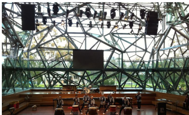
Figure 5: Poster for "Hiroshima and Nagasaki Peace Concert 2013". 31