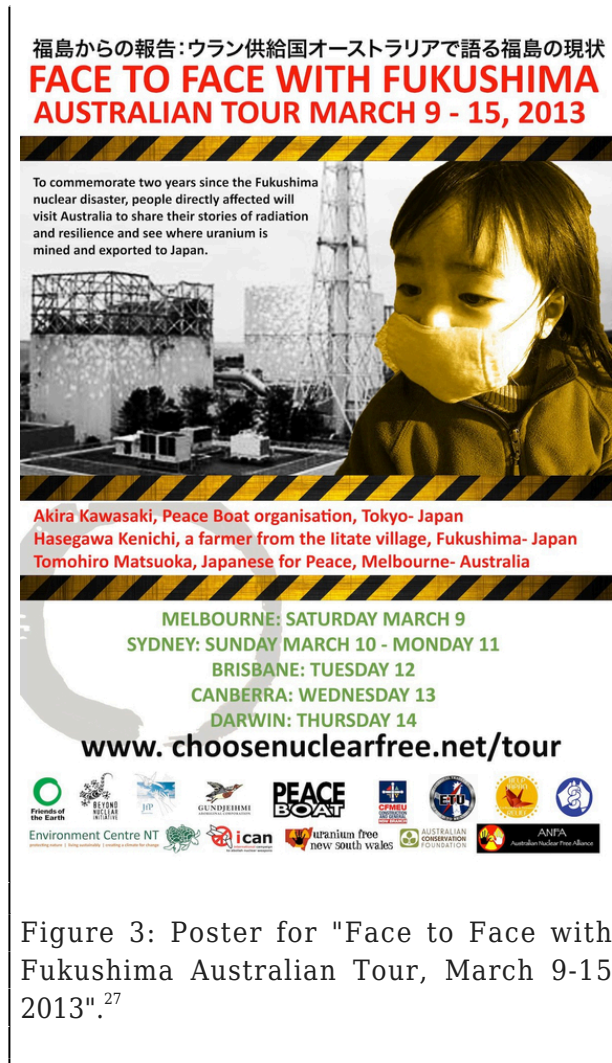
Figure 3: Poster for "Face to Face with Fukushima Australian Tour, March 9-15 2013". 27