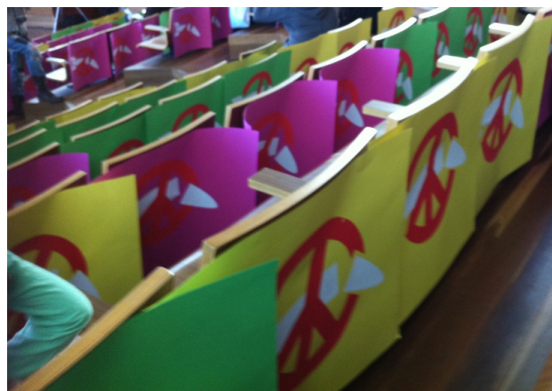
Figure 7: Japanese for Peace Logo. 32