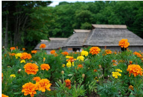
Chise, Ainu Home. From the Japan Focus Version, January 24, 2009.

than did Mashiho. He also sets off the refrain from the rest of the text. His translation is from Ainu oral tradition as transcribed by Yukie. The following is the first English translation from Yukie's Japanese rendering of the original, which is both a literary product in its own right and a text that has been widely read and recognized in Japan as a landmark of Ainu creativity and Ainu-Japanese cultural relations.