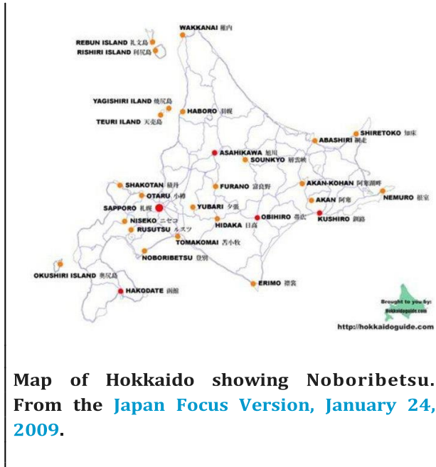
Map of Hokkaido showing Noboribetsu. From the Japan Focus Version , January 24, 2009.