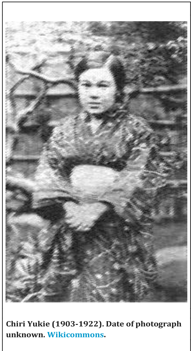
Chiri Yukie (1903-1922). Date of photograph unknown.

Yukie's book contains thirteen songs of gods, such as the owl, fox, rabbit, little wolf, sea, frog, otter, and swamp mussel deities, and the spirit of the damp ground. "Silver Droplets Fall" is the first in her collection, and one of the two owl god songs. The owl (or more precisely, in Horobetsu, Blakiston's eagle owl) is kotan-kor-kamuy , the guardian god of the kotan (hamlet).