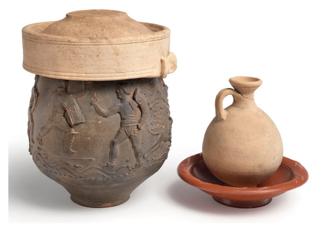
FIG. 3. The grave group: Taylor Collection Grave 14/13, Colchester Museum Accession number COLEM: PC.727–730. Not to scale (Vase height 212 mm).