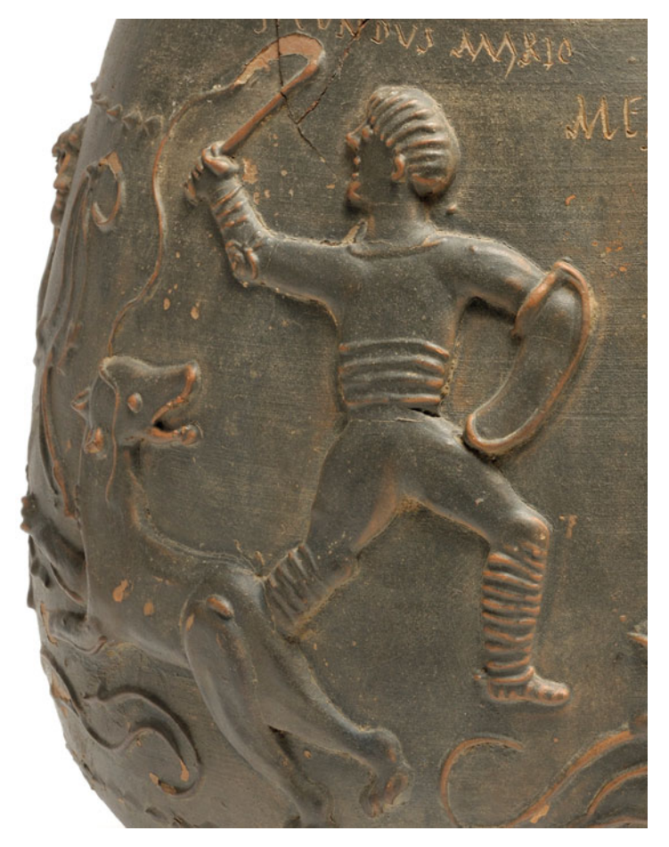
FIG. 4. Fissures on the body of the man whipping the bear. Not to scale.

decoration. This effect is found on other decorated beakers made c. A.D. 160–200 at the Oaks Drive kilns in Colchester. <sup>17</sup>