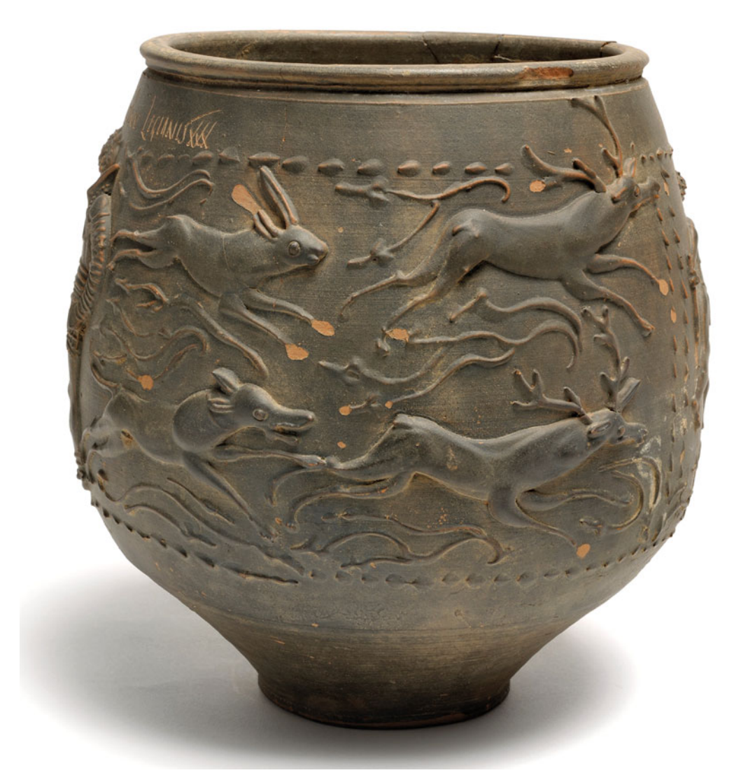
FIG. 10. Colchester Vase, Scene 3. Not to scale (height 212 mm).

floor of a barracks, and another, from Zugmantel, Germany, was found in a deposit with 55 coins, the latest being of Commodus and Crispina (A.D. 177–92/178–91).<sup>48</sup>