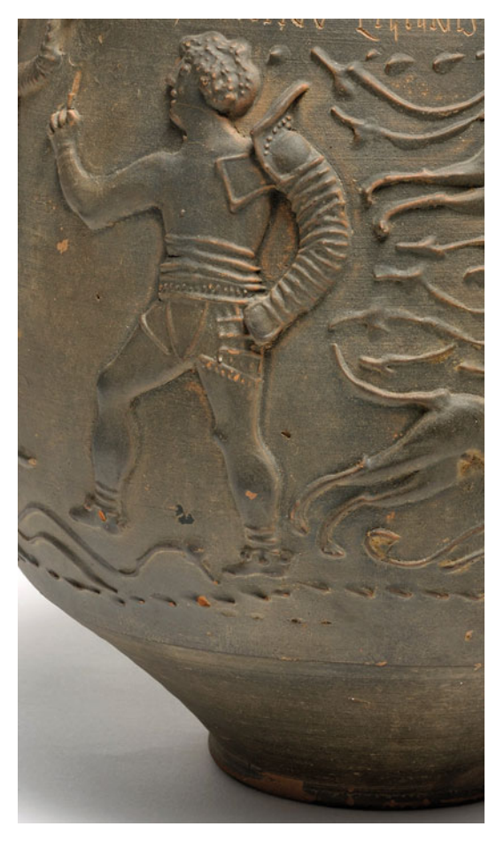
FIG. 5. Indentations pre-dating the application of the slip. Not to scale.

on an early-mid-third-century villa mosaic from Nennig, Germany.<sup>35</sup> The bestiarii are armed only with whips against a bear; their guards clearly completely enclose their forearms and are secured by cross-straps. One paegniarius has a whip and thick knobbed stick (cudgel?) and the other a similar thick stick and thinner second one. A duelling pair on a samian vessel from Trier Werkstatt II are much the same, except that the fighter with two sticks is bare-chested and all the sticks are knobbed, as is the stick wielded by a nude figure on the Zliten mosaic.<sup>36</sup>