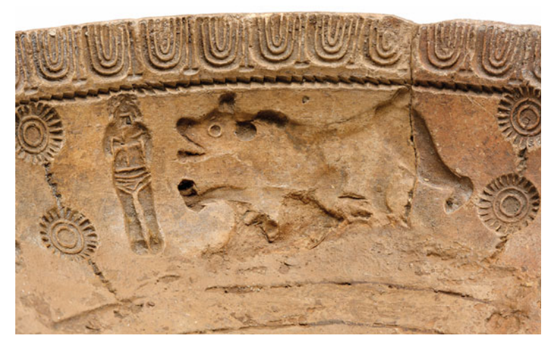
FIG. 11. Potter A mould fragment for a Colchester samian bowl, showing a bear attacking a damnatus/noxius (accession number COLEM:1957.22). In Hull 1963 (fig. 20, 2) the drawing reverses the image to show the end product. Not to scale.

in style to that on the Vase, also attacking a damnatus/noxius (FIG. 11).<sup>70</sup> Barbotine wares made at Cologne also show some links with Colchester. The Cologne potters usually featured animal hunts, but they did occasionally make pots with figures wearing similar padding and armour to those on the Vase.<sup>71</sup> The forms also provide parallels: both centres produced large beakers like the Vase during the second century,<sup>72</sup> and both made the form of lidded bowl known as the 'Castor box' and decorated it with barbotine.<sup>73</sup>