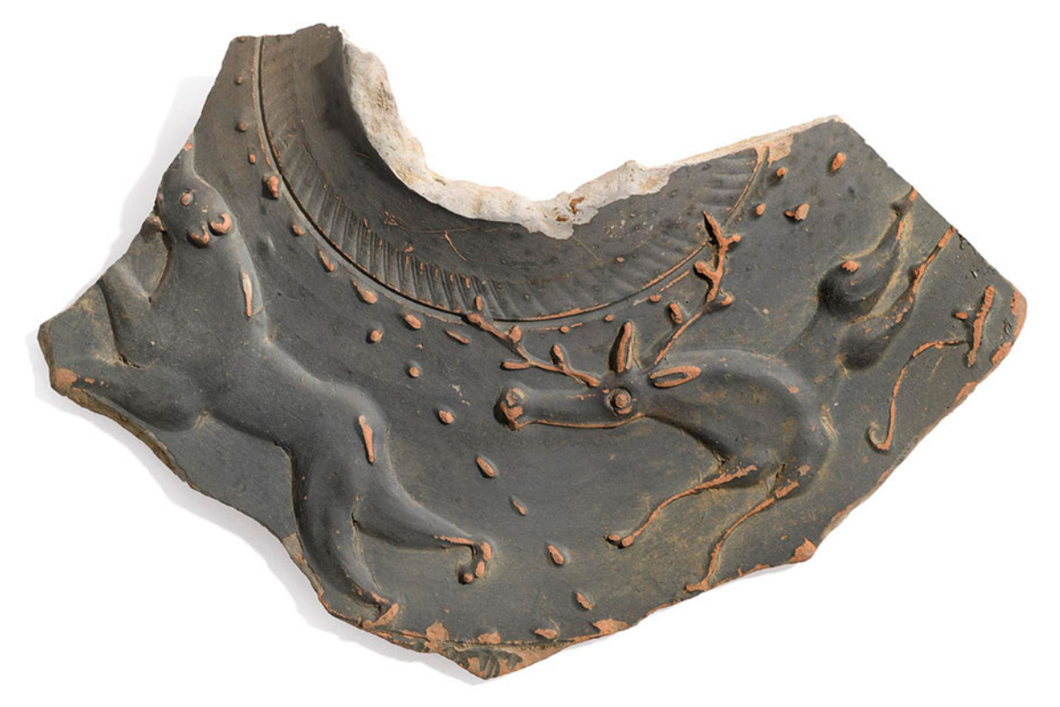
FIG. 8. A bear and stag on the lid of a Colchester colour-coated ware bowl. Not to scale.