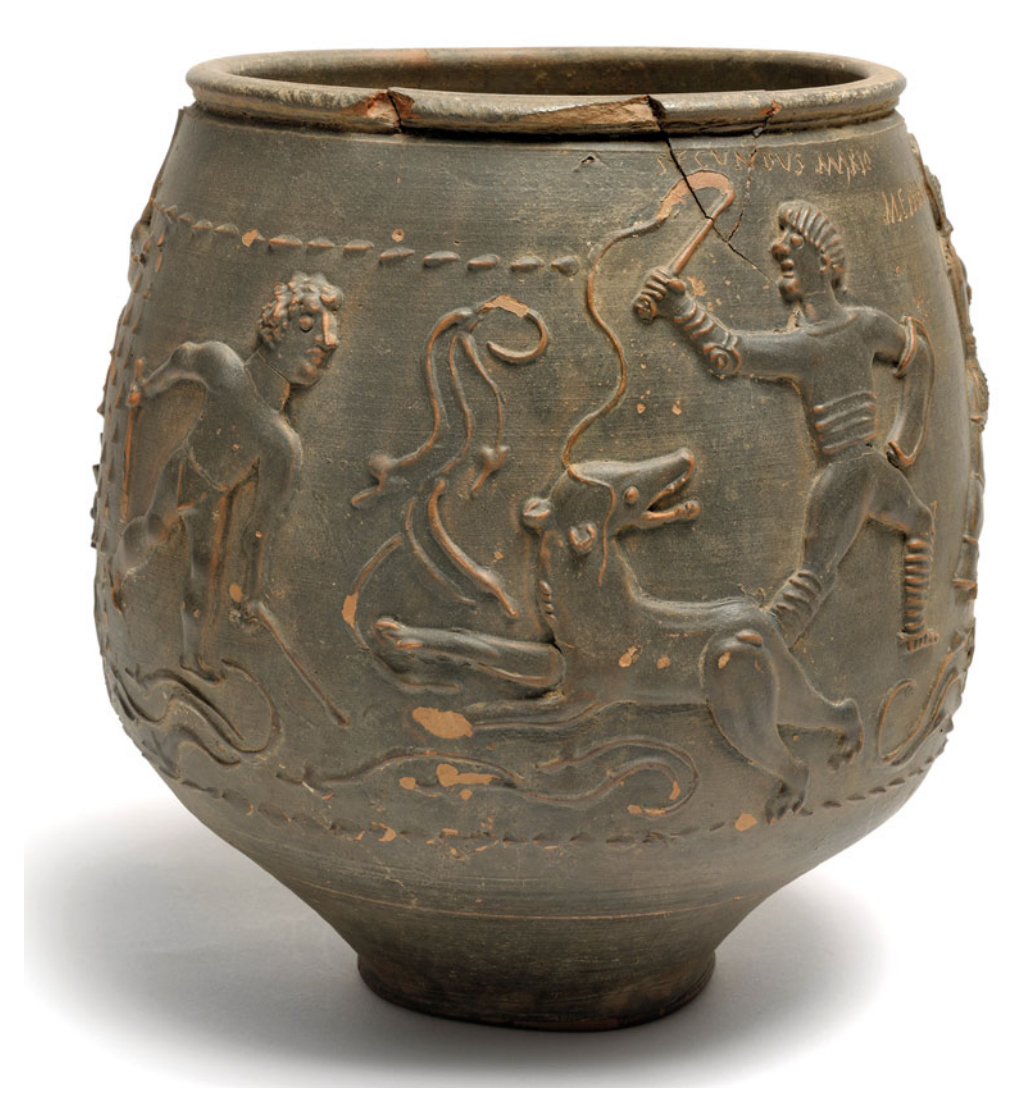
FIG. 6. Colchester Vase, Scene 1. Not to scale (height 212 mm).

rather than of a full-scale venatio ending in the deaths of beasts and men,<sup>37</sup> and they may have had a long working relationship with each other and with the bear. A curly-haired man, very like the figure on the left but with only one stick, is on another Colchester colour-coated ware beaker, where he is shown driving children or dwarfs dressed as genii cucullati towards a dog (FIG. 7, left).<sup>38</sup> Another curly-haired man whipping a bear is on the same beaker; he has