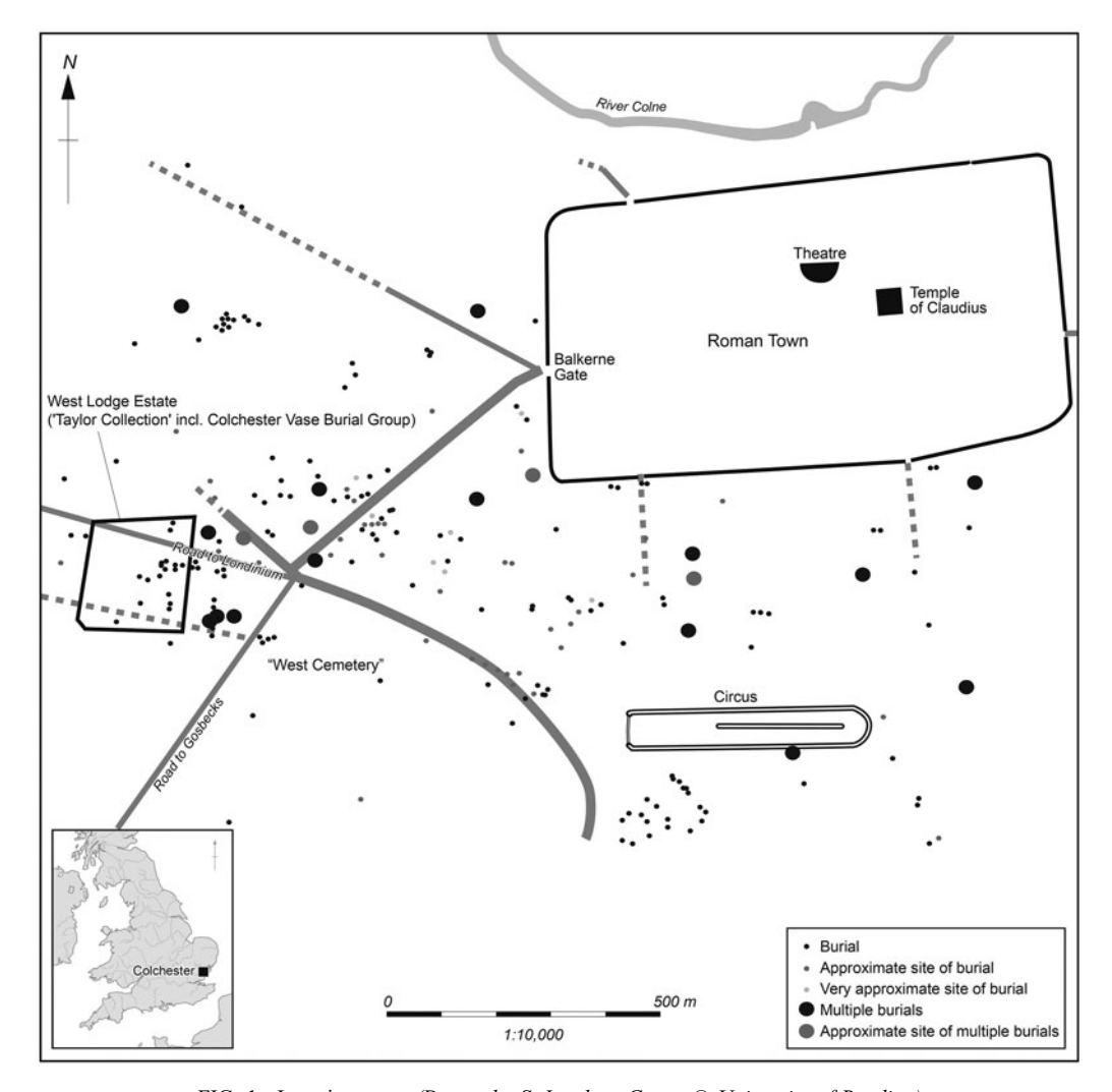
FIG. 1. Location map. (Drawn by S. Lambert-Gates; © University of Reading)

barbotine leaves round the rim, and dates to the Antonine period.<sup>6</sup> In the context of this burial the rim design may refer to the wreaths awarded to victors in the arena and circus, but evidence from other burials in southern Britain suggests rather that Dragendorff 35 and 36 dishes with leaves on the rim were used as grave goods evoking the funerary wreaths that adorned the dead.<sup>7</sup> The flagon is in a buff fabric, one of the local miscellaneous oxidised wares not sufficiently distinctive to be a separate fabric, with grooved handle and three rings cut at the neck. The form has been found associated with several kilns and was clearly both popular and long-lived; it is dated from the Hadrianic period to the early third century.<sup>8</sup> The mortarium is in a cream fabric with dense