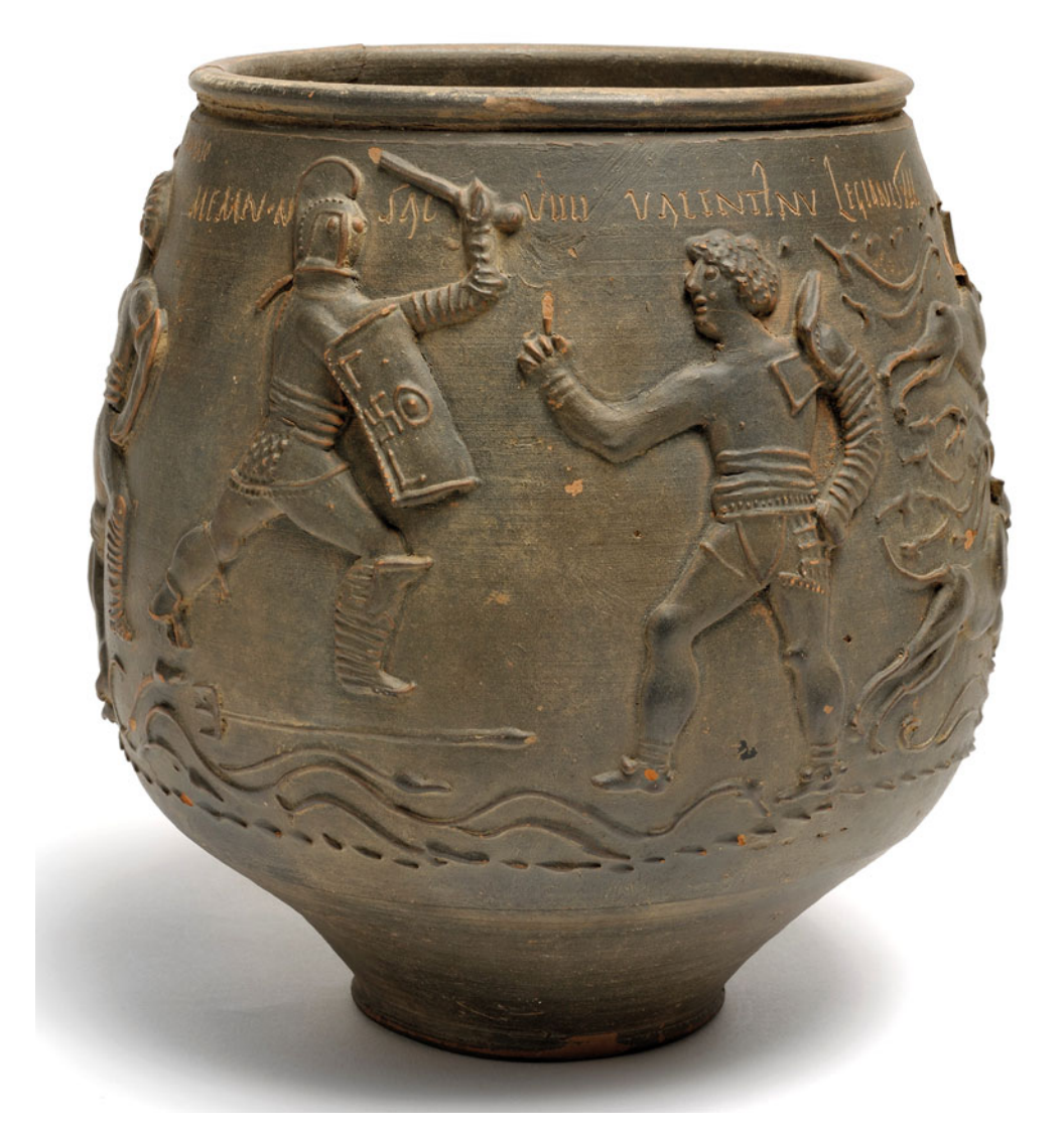
FIG. 9. Colchester Vase, Scene 2. Not to scale (height 212 mm).

rectangular shield is smooth at top and bottom but has small bosses running down the side. There are extended L-shaped ridges at each corner of the shield, and a central boss. Between the boss and the side is a raised right-facing (propitious) swastika or gammadion , a motif also seen on late second- to third-century brooches, with excavated examples generally coming from military sites from Hadrian's Wall to Dura-Europos in Syria.<sup>47</sup> One from Chester was found on the