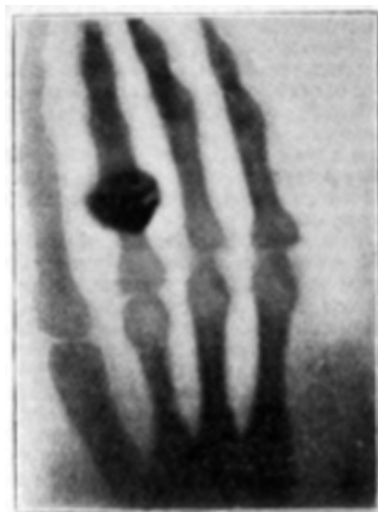
Figure 1 X-Ray image from Röntgen (1896, 276)

Röntgen's (or similar) experimentation will rest upon evidence gleaned from visual perceptual experience. Only the most skeptical of opponents would gainsay. (I am not claiming that we visually perceive X-rays.)