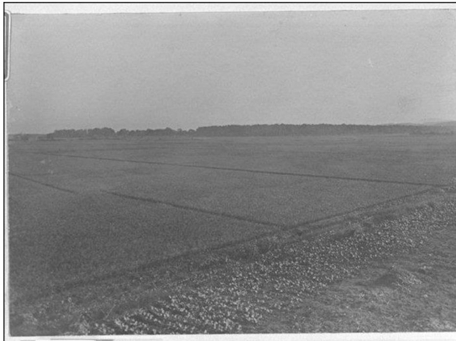
The geometry of rice cultivation, Hokkaidō 1909