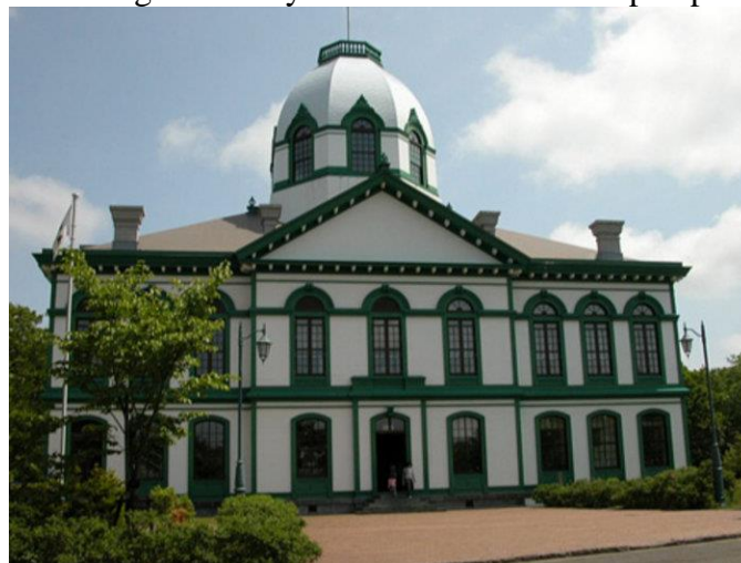
Hokkaidō colonial headquarters, Sapporo

Hokkaidō is the most important place for the Northern Gate of the Empire. With regard to the proclaimed development, sincerely carry out the Imperial Will, and make efforts to spread welfare, education and morals with kindness. With the gradual immigration of mainlanders, make sincere efforts to encourage harmony with the natives and a prosperous livelihood. [3]