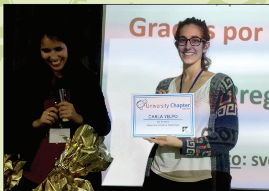
Right: Student receives her certificate of participation at the Materials Science Challenge event in Uruguay.

to encourage the participation of young people, from Uruguay and the region, in materials science.