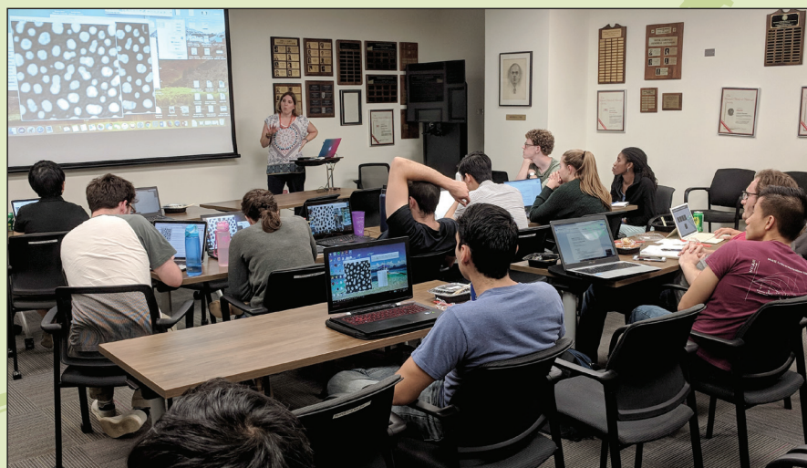
Top: Students at Northwestern University attend an ImageJ software workshop to become familiar with the image processing tool.

The Materials Science Challenge activity in Uruguay was inspired by an Advent Calendar, which counts the days between April 1 and 13, when the “Primer Encuentro de Jóvenes Investigadores en Ciencia de Materiales” (First Meeting of Young Researchers in Materials Science) started. Its main goals were to disseminate materials science in Uruguay and