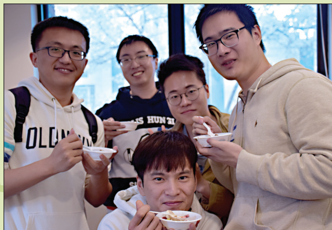
The MRS University Chapter at Boston University held a Materials Madness event, where teams competed in materials science challenges. Top: Students work together to build the strongest/tallest tower using toothpicks, gumdrops, and marshmallows. Bottom: Students are enjoying liquid nitrogen ice cream made during the event.