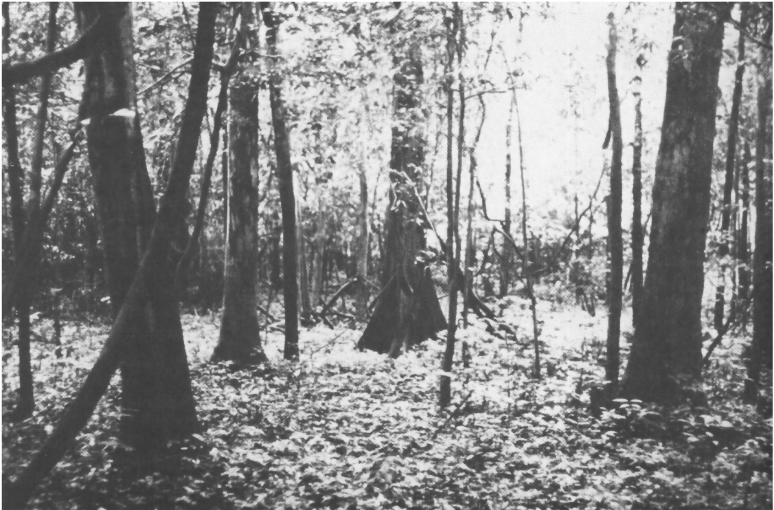
High restinga at Lake Teiú; note sparseness of the understory.

1). One tree, Piranhea trifoliata , provides a vital food source at times of overall fruit shortage in the form of swarms of caterpillars of a species of noctuid moth. Loss of these trees would introduce a periodic critical food shortage, not only for uacaries but also for insectivorous birds, which also feed on the caterpillars, and for the frugivorous fishes, which eat the floating seeds of the tree (Goulding, 1980). It is a very common tree of várzea at present, but all large specimens of a tree can be removed very quickly (as shown by the almost complete eradication of Ceiba pentandra in one year, 1984, when it suddenly became commercially valuable).