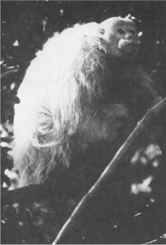
Adult male white uacari ( L. C. Marigo ).

(less than 20,000 years old) and only three other primates exist: the red howler Alouatta seniculus , the black-capped capuchin Cebus apella , and a squirrel monkey, either Saimiri vanzolinii or S. sciureus . All are generalists, feeding on a wide variety of foods. White uacaries are specialist frugivores feeding mainly on the seeds of unripe fruit, although they also eat mesocarps and arils of ripe fruit, nectar and a few insects. They are able to live in young várzeas , despite their specialized feeding habits, because of particular botanical characteristics of the restingas . Trees of the Brazil nut family (Lecythidaceae) and lianas of the family Hippocrateaceae appear very quickly and are abundant in restingas ; both have large-seeded fruits, which form a major component of the uacaries' diet, and only they are able to open the tough seed cases. Fallen fruits and seeds are another important food source, and entire troops can sometimes be seen foraging on the ground (Ayres, 1987). In non-flooding