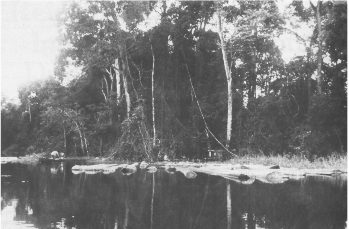
Logging camp in várzea close to Lake Teiú (J.M. Ayres).

the soil is better aerated and where the flooded period is short.