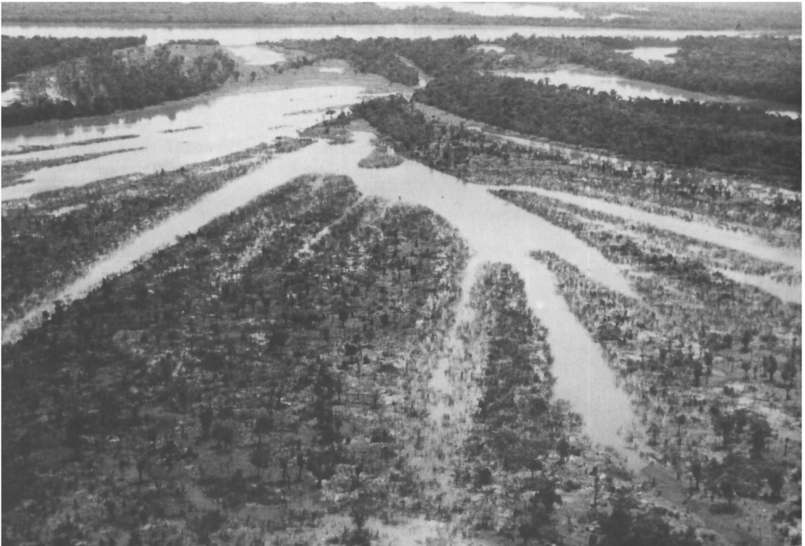
Aerial view of young várzea in the range of the white uacari; the water level is low, but still receding.