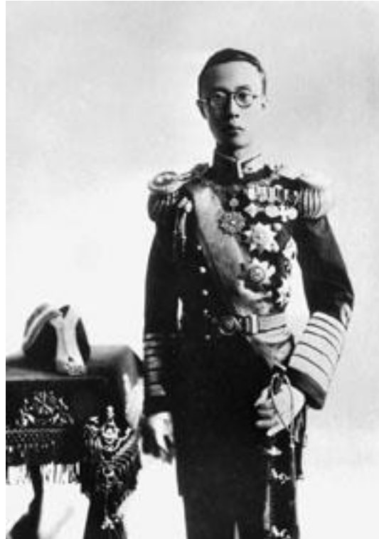
Pu Yi as emperor of Manchukuo

Brotherhood or, more broadly, the family relationship among East Asian peoples implied sharing a mission regardless of one's preferences. It was the obligation of the patriarch or the older, dominant brother to create the ethos of the family, its enterprise, and deliver the goods it promised. Japanese rhetoric did not fully develop this metaphor to embrace the relationship between Japan and Manchukuo, and the rhetoric always appeared somewhat contradictory, perhaps because of the continued lip service to the independence of Manchukuo. Nonetheless, by 1940 the "family state" model was utilized to characterize the relationship of citizen to state within Manchukuo: "National citizenship is the expanded version of family membership. Just as the family member has an obligation to obey the family unconditionally, so does the citizen have to obey the state." (26) Manchukuo was developed as an East Asian brother or son who set up a house modeled closely upon, and subordinate to, that of the Japanese patriarch. Practically, this structure meant using Chinese officials at all levels, including in the top administrative and political positions, but having their activities supervised by Japanese officials responsible ultimately to the Kwantung Army.