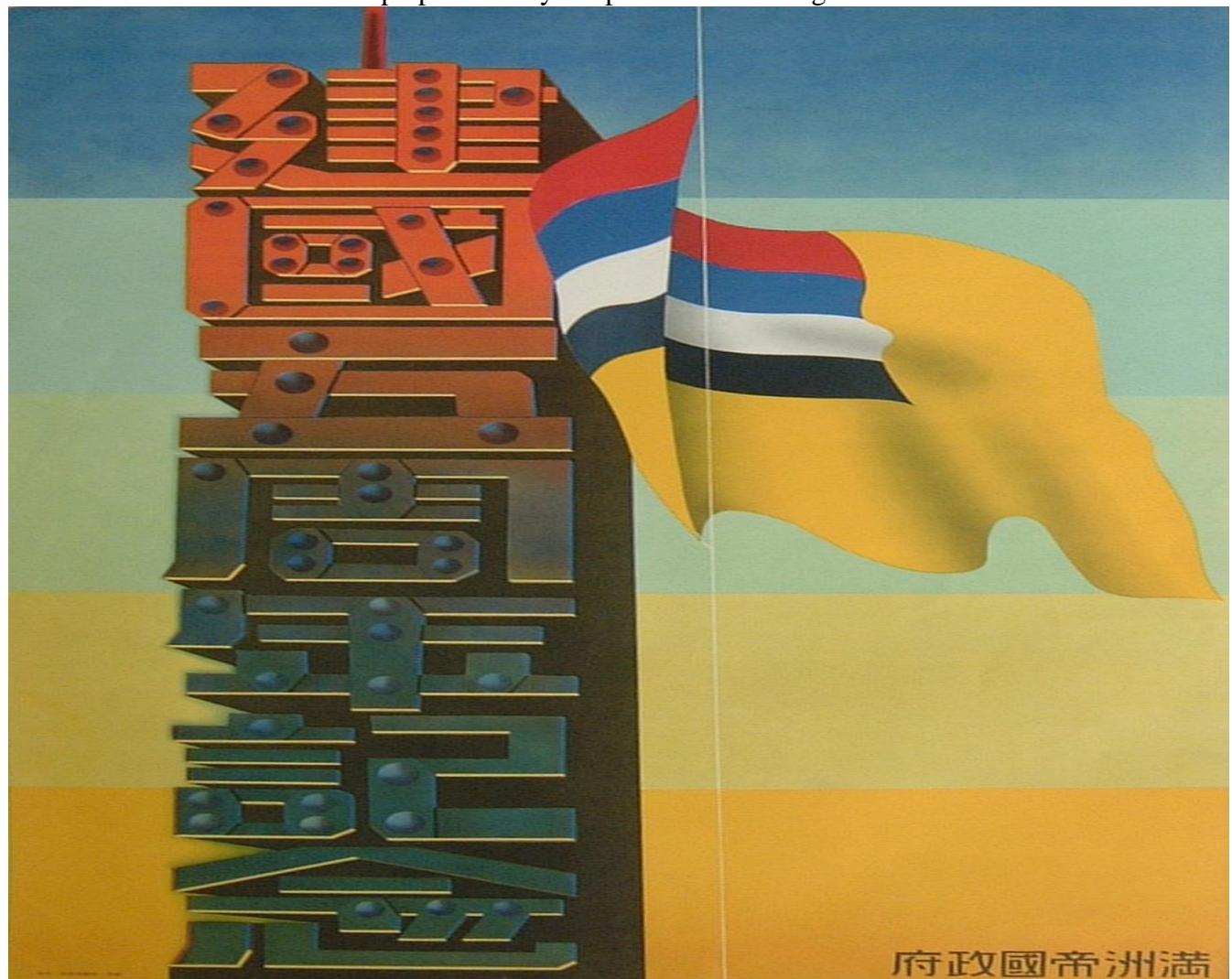
Manchukuo's industrial production

1933 and 1942, and producer goods output grew the fastest.(28) Considerable attention was also paid to the social infrastructure, at least in the urban areas: to the system of public health and education.(29) The new regime always touted these achievements as having reversed the decades of warfare and economic chaos perpetuated by the previous warlord government.