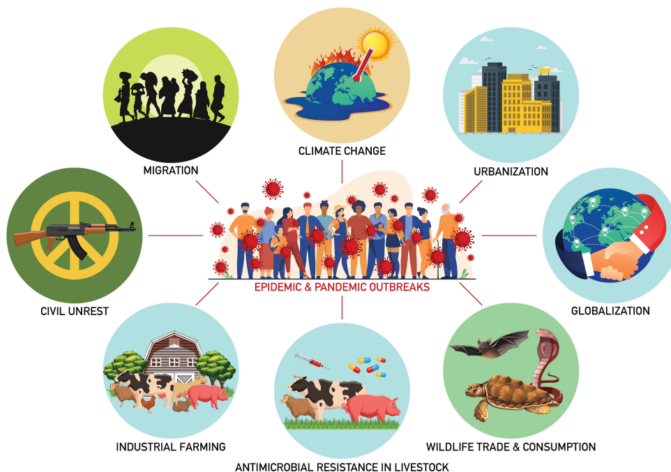
Fig. 1. Major drivers of the emergence of epidemics and pandemics.

Apart from wildlife trade, deforestation also brings humans closer to the wild and opens the gate for the spread of emerging diseases. Urbanization, land use for industrial farming, monocul-