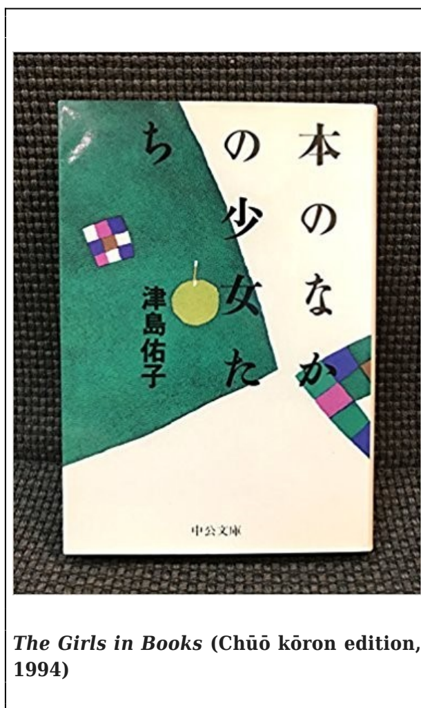
The Girls in Books (Chūō kōron edition, 1994)

Tsushima Yūko is a writer's writer—someone with intimate knowledge of written prose, poetry and song from the classical period to the present. She is also someone whose choice of genres and modes changed in topic and style over the course of her life, as it came into