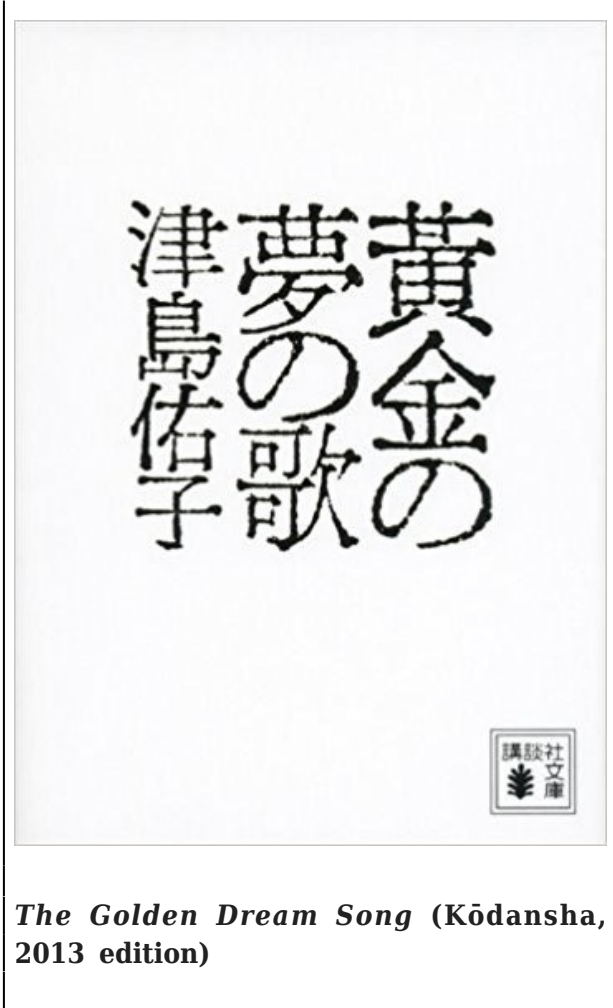
The Golden Dream Song (Kōdansha, 2013 edition)

Tsushima’s interest in narrative forms from and about Japanese geo-peripheries, especially displaced, orphaned ones, extends to aboriginal and oral cultures around the world. Some of these cultures, as archived in writing and song, demonstrate kinds of autonomy that became a collectively-linked site for exploring a different mode of what we have come to call “world literature.”