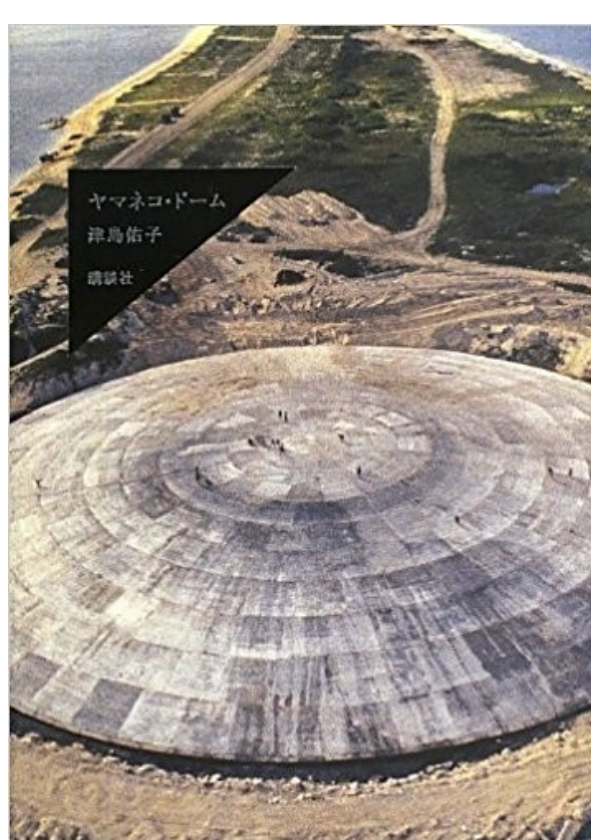
Wildcat Dome (Kōdansha, 2013 edition)