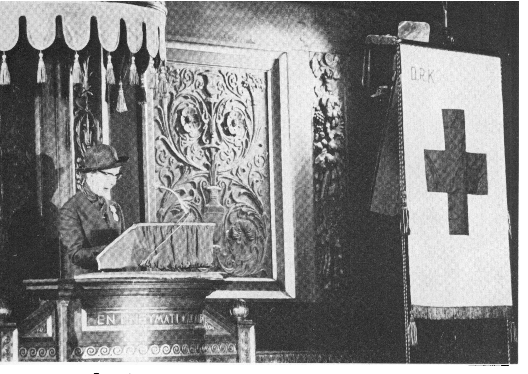
Copenhagen: The Queen Mother of Denmark speaking at the official session organized on the occasion of the Centenary of the Danish Red Cross...