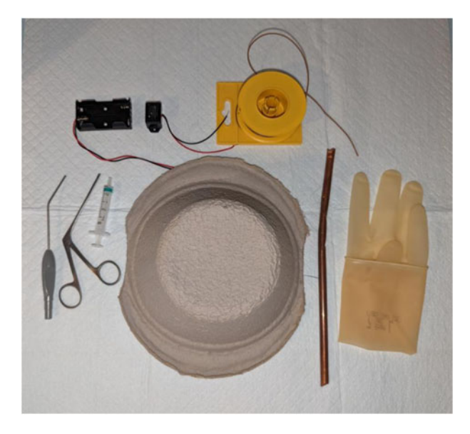
Figure 1. Components needed to build an enhanced low-fidelity ear simulator.

pipe and otomicroscopy instruments (aural microsuction and crocodile forceps). When the instrument tip touches the ear canal, which is painful and risks canal trauma in real patients, the buzzer alarms, thus providing objective performance feedback to the user. The instrument arms were painted to ensure that only the tip of the instrument set off the buzzer.