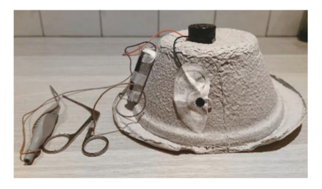
Figure 2. Enhanced low-fidelity ear simulator with buzzer for feedback

There were eight non-expert participants (two medical students and six junior doctors). The overall average number of touches per attempt for the first model used was 6.13 on the first attempt and 2 touches on the fifth attempt. The overall average number of touches for the second model used was 4.5 on the first attempt and 0.88 touches on the fifth attempt.