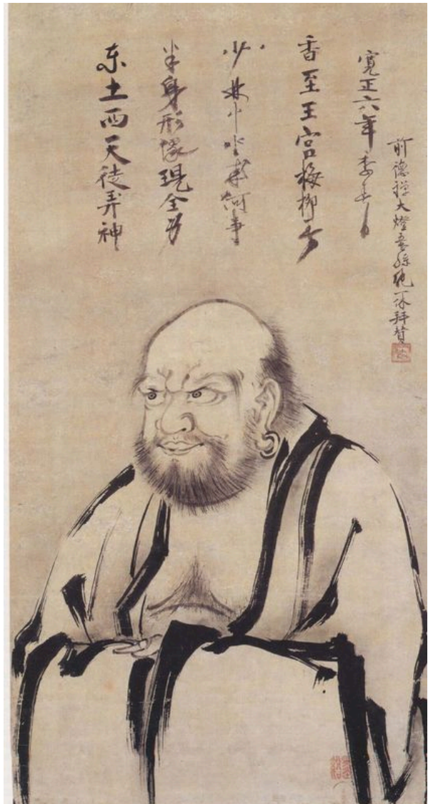
Daruma (S: Bodhidharma), Bokkei Saiyo (fl. 1452-73), hanging scroll, ink on paper

110.0 x 58.3 (43¼ x 23), Muromachi period, no later than 1465, Shinju-an,