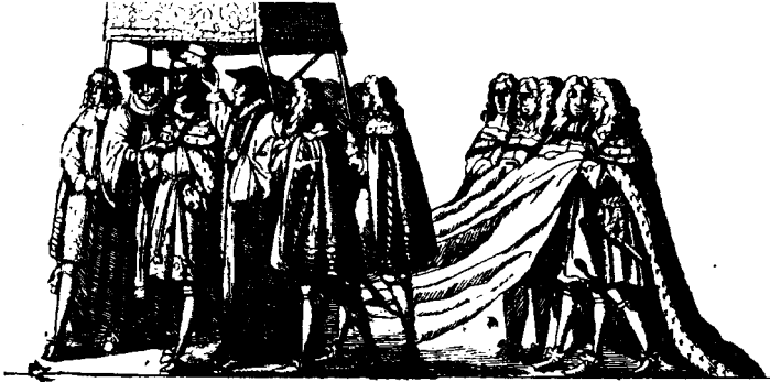
Charles II in his Coronation procession

Large crown 8vo. Volume I, 597—1603. Price 4s. 6d. Volume II, 1603—1815. Price 3s. 6d.