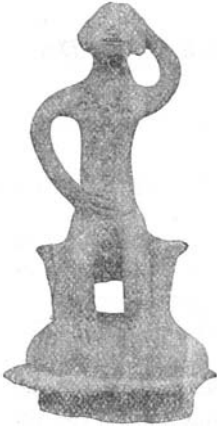
Prehistoric pottery from the Nilgiris