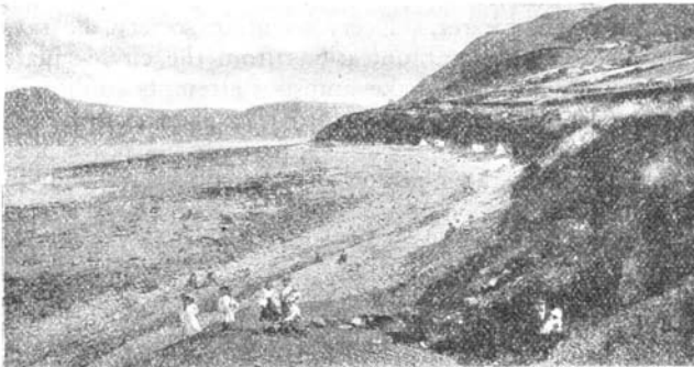
The Beach, Llwyngwril

Crown 8vo. pp. x + 166. With maps, diagrams and illustrations. Price 1s. 6d.