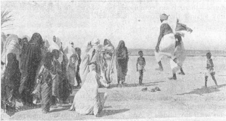
Hamitic wedding dance

Demy 8vo. pp. xvi + 158. With 91 maps and illustrations and 12 diagrams. Price 10s. 6d. net.