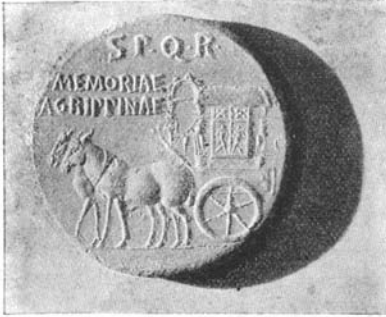
Carpentum of Agrippina the elder