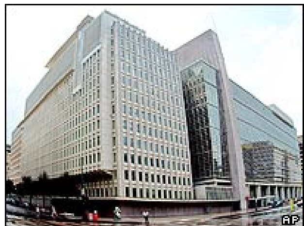
World Bank headquarters

president of the World Bank [1] provided the occasion for strident calls from the American Enterprise Institute (AEI) urging Wolfensohn "to begin an orderly transition to private ownership. For the same skills through which Wolfensohn achieved his great success in the world of finance [as a Wall Street investment banker] could be turned toward a successful privatization of this huge financial institution. Transition to private Bank ownership promises to save taxpayers in America and other Western countries billions of dollars in the coming years - even to refund billions of dollars to their national treasuries. No less important, a privately owned and operated World Bank could be more effective at promoting and supporting international economic development than the current organization -- whose very structure encourages unsound, even perverse, economic practices in the countries to which it lends"[2].