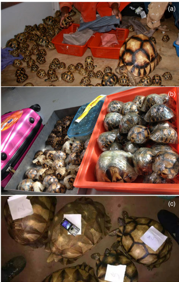
FIG. 3 Photos of the illegal trade in ploughshare tortoises. (a) A shipment confiscated in Madagascar at Ivato International Airport in July 2011 included 27 juvenile and 1 adult ploughshare tortoise, 169 radiated tortoises Astrochelys radiata , and a spider tortoise Pyxis arachnoides (Durrell Wildlife Conservation Trust, 2011). (b) A seizure of Malagasy tortoises in Thailand in 2013 included 54 ploughshare tortoises and 21 radiated tortoises (Panjit Tansome, TRAFFIC 2013). (c) Five adult ploughshare tortoises, two of which are clearly engraved, for sale on a Chinese website in June 2015.

density in this area to be equivalent to the mean density across the rest of the species' range. Given its challenging accessibility, this may be an important site for ploughshare tortoises and requires continued intensive protection. Thirdly, as a result of the low numbers of juveniles observed, we were limited to estimating population size and density for adults and subadults. Smaller individuals are hard to detect in the dense bamboo scrub, but the lack of sightings of juveniles in some subpopulations in 2011–2013 and 2014–2015, compared with earlier years, suggests a decline in the number of individuals in this age class. Most of the ploughshare tortoises confiscated have been juveniles, which can be more easily concealed and transported in large numbers (Fig. 3), and this could partially explain the lack of sightings of juveniles.