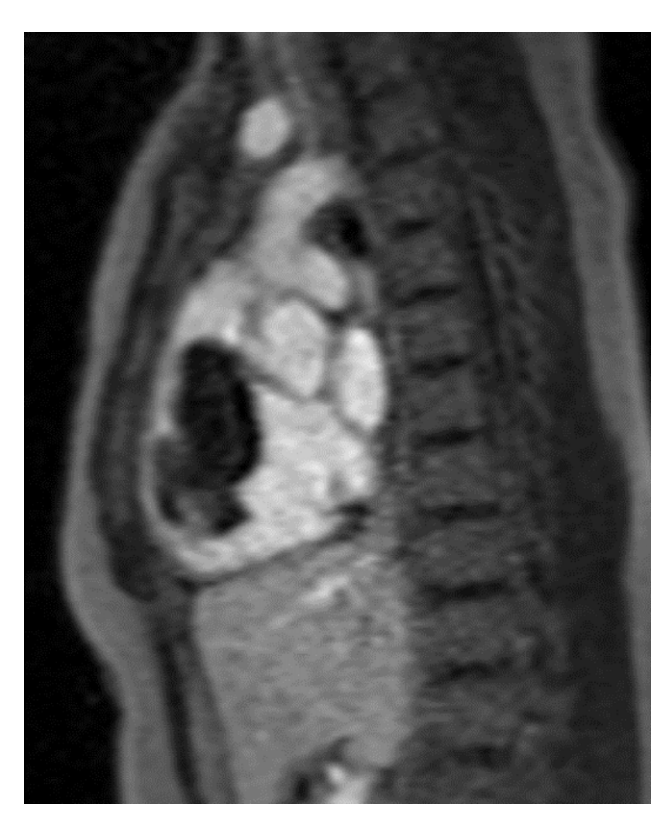
Figure 3. MRI image in right ventricle (RV) inflow/outflow view showing a mobile, heterogeneous cardiac mass connecting to a stalk arising from mid body of RV cavity measuring 6.2 \times 2.9 \times 3.2 cm.

extending through right ventricular outflow tract, right ventricular dilation, and normal right ventricle function (Image/Video 2). Additional laboratory results showed a normal white blood cell count, haemoglobin, and platelet count. Inflammatory markers