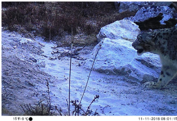
PLATE 1 Snow leopard photo-trapped in Gaurishankar Conservation Area (Fig. 1).

photographs of a snow leopard, the first photographic evidence of the presence of the snow leopard in Lapchi Village and the Lamabagar corridor (Plate 1). Whether this snow leopard was a seasonal visitor or has a permanent home range in the area will require further study. The camera that captured the snow leopard recorded four other mammalian species: musk deer, blue sheep, red fox Vulpes vulpes and bobak marmot Marmota bobak .