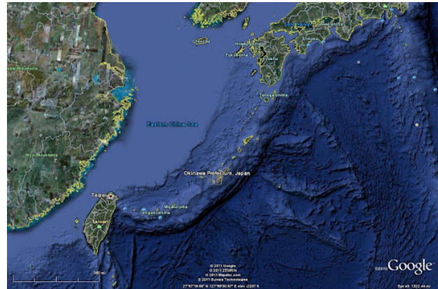
East China Sea from Space (Google)

Mage and Yonaguni, both once renowned for the richness of their biodiversity, are thus to become centres for the preparation and conduct of war.