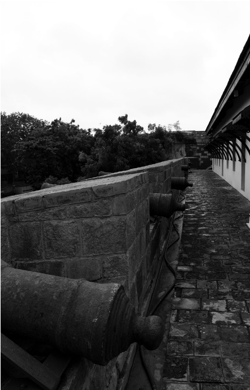
Figure 1.2 Locus of “revolution”: Rampart, Surat Fortress. Built in the mid-sixteenth century by an Ottoman Turkish grandee at the Gujarat Sultanate, the fort was taken by the Mughals during Akbar’s reign (1556–1604). The East India Company captured it with the Castle Revolution of 1759.