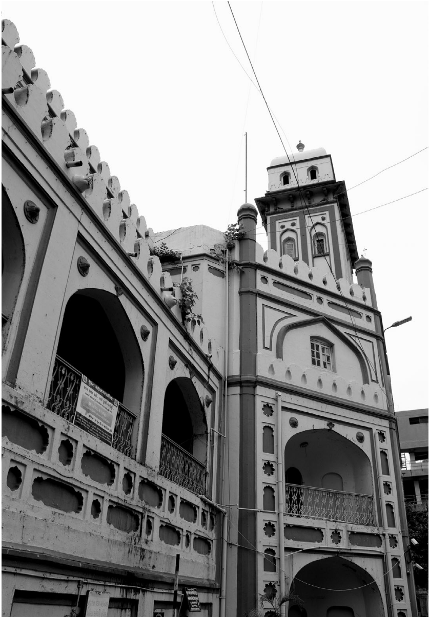
Figure 1.1 At the Gate of Mecca: Mughal hajj caravanserai, Surat, Gujarat, built in 1644. Built by the Mughal nobleman Ishaq Beg Yazid Haqiqat Khan (d. 1663–1664).