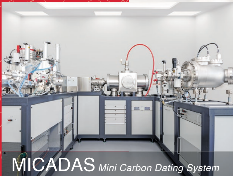
MICADAS Mini Carbon Dating System

Scientific Instruments for Radiocarbon Dating and Accelerator Mass Spectrometry