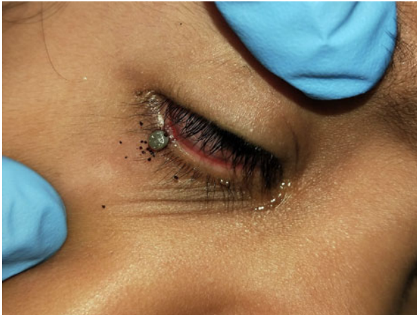
Figure 1. Clinical photograph of tick attached to the right lower eyelid with its eggs scattered on the skin surface with an associated area of ulceration.

with our patient was uneventful, and she was discharged from our service.