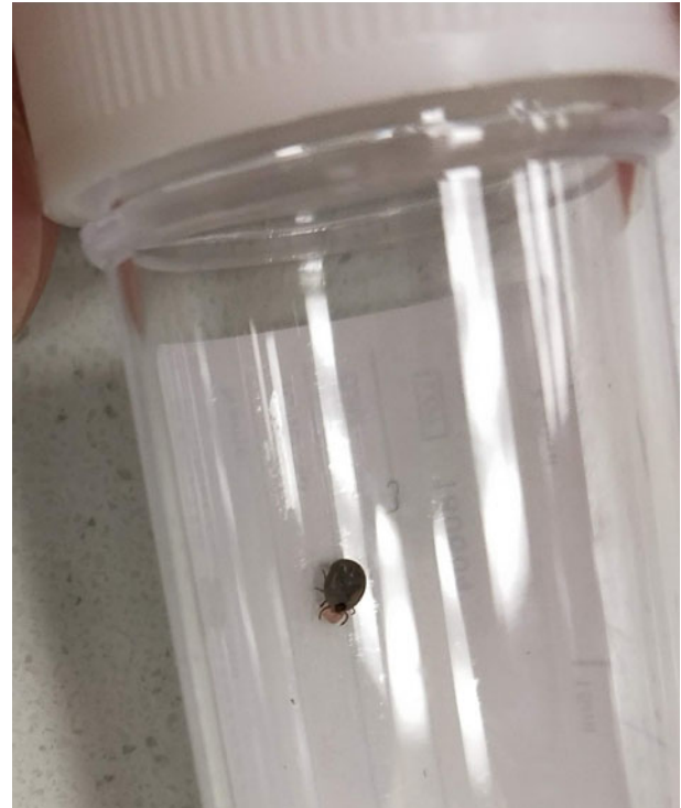
Figure 3. Clinical photograph of extracted tick.