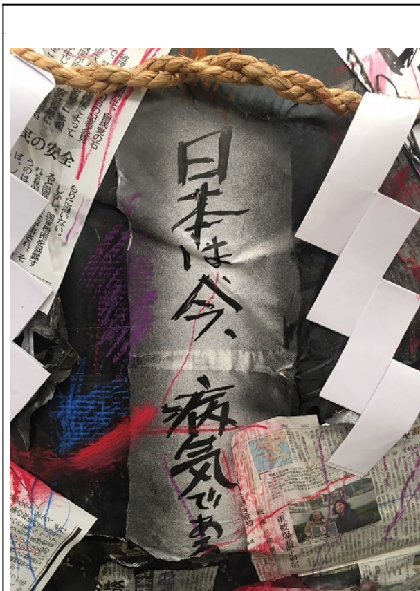
Nakagaki Katsuhisa, "Portrait of the Period - Endangered Species idiot Japonica."

In one sense, the reaction by the Japanese establishment bore out the worst fears of the Aichi curatorial team and seemed to confirm the old dictum that censorship reflects a society's lack of confidence in itself. Okamoto Yuka, a member of the Freedom of Expression Organizing Committee, called the shutdown an act of "artistic violence" and blamed not just the shifting political climate under Prime Minister Abe Shinzo but a worldwide clampdown on freedom of expression. The Japanese government's response was mealy-mouthed at best. Suga Yoshihide, the chief cabinet secretary, called the threats against the exhibit wrong "generally speaking". A month later, the Agency for Cultural Affairs pulled Yen 78 million in subsidies for the Triennale because of "inappropriate procedural matters." Education Minister Hagiuda Koichi, who is in charge of the agency, denied he was in effect telling the rightwing mob that violent threats work. The decision to terminate the funding was based solely on "whether the event could be properly managed and organized," he said, to widespread skepticism.