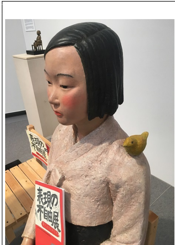
“Statue of Peace” (1&2) by Kim Seo kyung and Eun sung.

Aichi pulled the plug, citing public-safety issues.