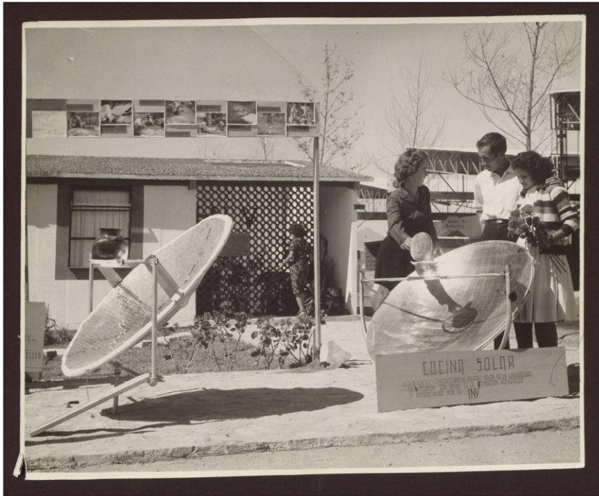
Figure 2. The Wisconsin solar cooker in Mexico.

Initial responses seemed positive. On closer inspection, though, the Americans discovered that ‘the minute we got out of sight [the cookers] were very carefully put away’ and never actually used. 94 When pressed, households reported similar grievances. The stove was expensive. The women disliked cooking for hours out in the hot sun, and the reflector’s mirrored glare hurt their eyes. The cooker did not work when it was cloudy, windy, or dark. It was flimsy, but simultaneously too bulky to shift. It cooked too slowly, and could handle only one dish at a time. Though useful for boiling water, it made bad tortillas. Overall, it simply could not compete with the oil stove as anything but a supplementary device—and which poor household would buy two cookers? 95