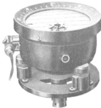
Campbell Bennett Aperiodic Compass.