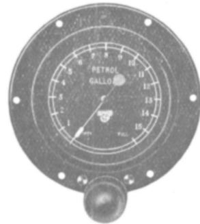
Smith's Petrol Level Indicator.

It is a significant fact that whenever a world's record or big international flight takes place Smith's Instruments are invariably fitted to the winning machine. Their reliability and accuracy has gained for them the reputation of being the leading aircraft instruments of the world.