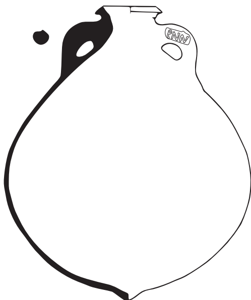
Figure 1. Dressel 20 amphora with a stamp, PNN, in one of its sides (after Aguilera Martín 2012).

Monte Testaccio is a 45m-high artificial mound in Rome located near to the east bank of the Tiber. It was created through the deposition of thousands of amphorae following their