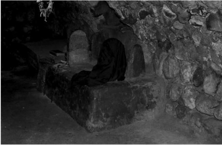
Figure 1. The tomb of Mem and Zîn in Cizre, Turkey, prior to renovations undertaken in 2007.

of the beloveds are discovered. Zeyneddîn grants permission for Tacdîn and Sitî to marry; but due to the scheming of his counselor Bekir, he refuses the betrothal of Mem and Zîn. As a result, both lovers slowly waste away with lovesickness. During a game of chess with Zeyneddîn, Mem openly declares his love for Zîn, at which the enraged prince imprisons him. Eventually, faced with the threat of open revolt by Tacdîn and his brothers, the prince announces that Mem will be released; but by then the latter is already on the verge of dying. After a final meeting, both lovers die soon after each other. They are buried together (Fig. 1), but Bekir, killed by Tacdîn, now takes the shape of a thorny juniper, preventing the two from uniting even in death.