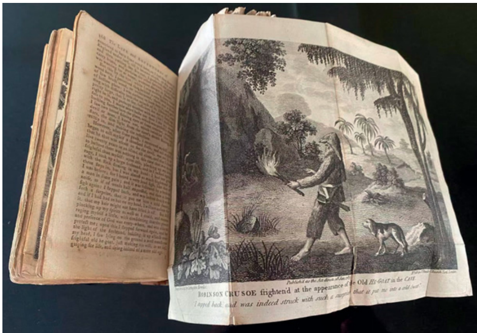
Figure 35 Extra-illustrated edition of Robinson Crusoe , 1778, featuring Carington Bowles's Crusoe prints.