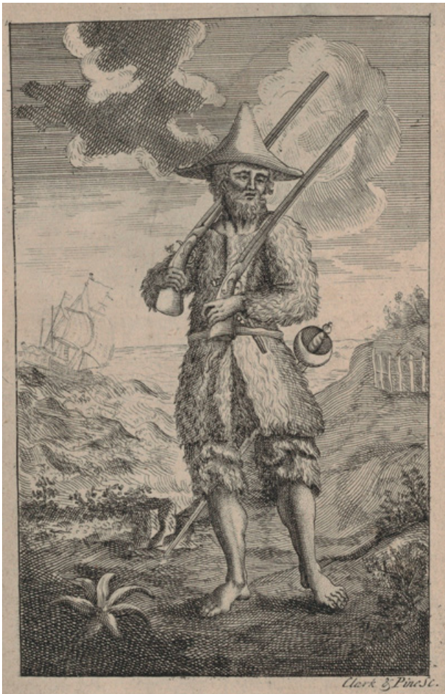
Figure 1 Copperplate portrait frontispiece, executed by Clark and Pine for Taylor's 1719 edition of Robinson Crusoe . Reproduced from a copy in the Beinecke Rare Book & Manuscript Library, Yale University.