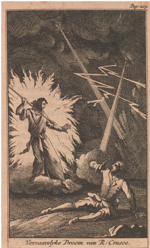
Figure 19 Copperplate of Crusoe's dream, Het Leven en Wonderbaare Gevallen van Robinson Crusoe (Amsterdam: de Jansoons van Waesberge, 1720).