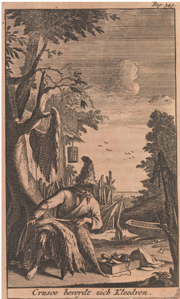
Figure 18 Copperplate of Crusoe producing his own clothes, Het Leven en Wonderbaare Gevallen van Robinson Crusoe (Amsterdam: de Jansoons van Waesberge, 1720).