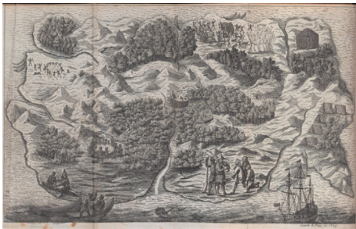
Figure 4 Copperplate ‘curious Frontispiece’ to Taylor’s 1720 edition of Serious Reflections , executed by Clark and Pine.

in Farther Adventures , the ‘curious Frontispiece’ ‘portray[s] . . . the island all by itself, disproportioned according to experience, independent of the surrounding Caribbean. . . . The island is a totally realized space, filled with both discrete objects and an ambient context that pulls them all together’ (Pearl, 2012, p. 139). Above all, however, it is the representation of settings (wooded areas, mountains, hills, rivers and instances of the built environment), human agents and the objects of mobility (canoes and ships), the latter invoking life beyond the island, which make them authentic to the reader eager to anchor the narrative iconically within the spatial matrix of the island given physical-representational shape by the map.