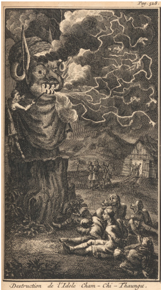
Figure 14 Copperplate of the destruction of the pagan idol, La Vie et les Aventures Surprenantes de Robinson Crusoe (Amsterdam: L'Honoré et Chatelain, 1720).