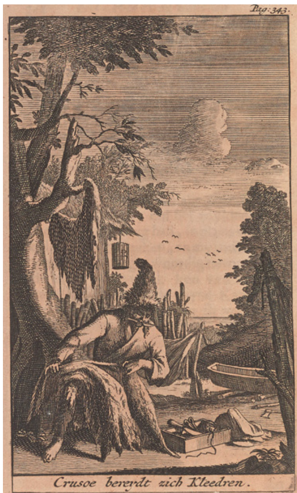
Figure 18 Copperplate of Crusoe producing his own clothes, Het Leven en Wonderbaare Gevalen van Robinson Crusoe (Amsterdam: de Jansoons van Waesberge, 1720).