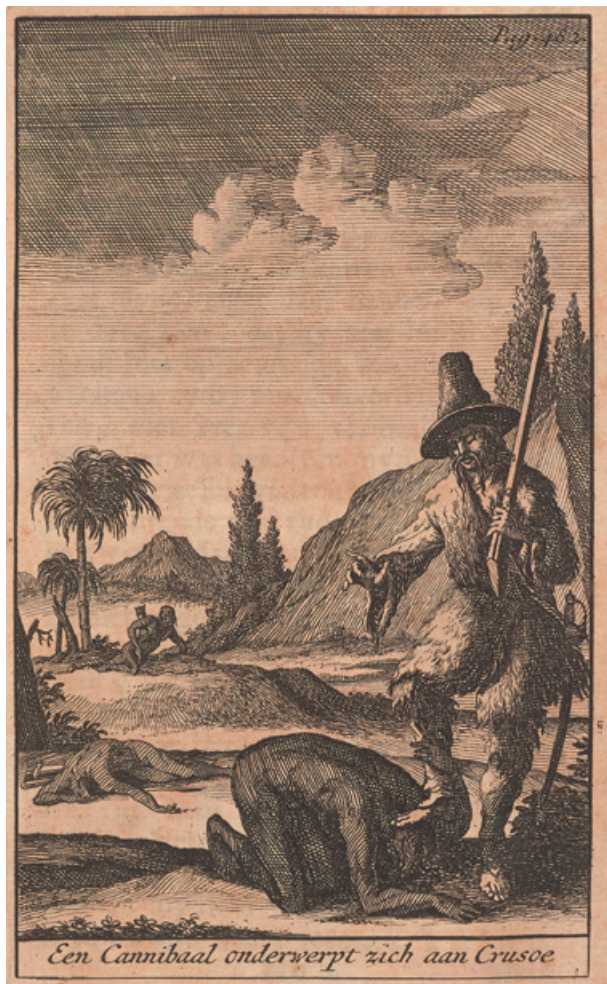
Figure 20 Copperplate of Friday's submission to Crusoe, Het Leven en Wonderbaare Gevallen van Robinson Crusoe (Amsterdam: de Jansoons van Waesberge, 1720). Reproduced from a copy in the Beinecke Rare Book & Manuscript Library, Yale University.