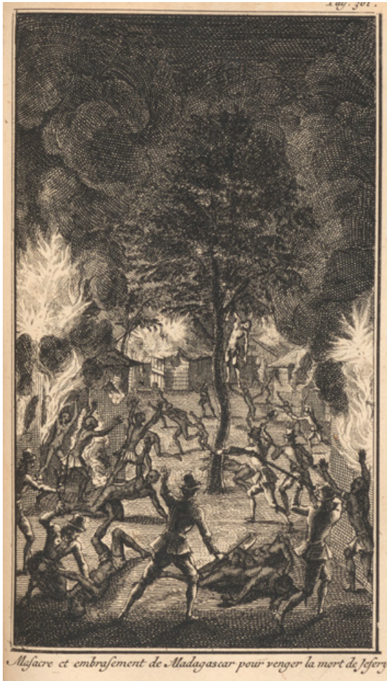
Figure 15 Copperplate of the massacre, La Vie et les Aventures Surprenantes de Robinson Crusoe (Amsterdam: L'Honoré et Chatelain, 1720).