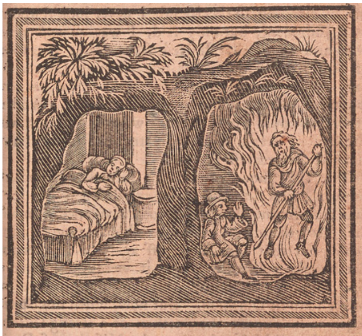
Figure 33 Woodcut of Crusoe's dream, The Life and Adventures of Robinson Crusoe ... The whole Three Volumes faithfully Abridg'd (London: A. Bettesworth, T. Brotherton and M. Hotham, 1722).

seen in illustrated chapbooks of Defoe's work is the result, as a text that is redacted more substantially and accompanied by a smaller number of illustrations enters into different medial relationships, especially once the woodcuts of the series are read cumulatively.