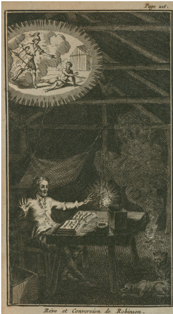
Figure 13 Copperplate of Crusoe's dream and conversion, La Vie et les Aventures Surprenantes de Robinson Crusoe (Amsterdam: L'Honoré et Chatelain, 1720).