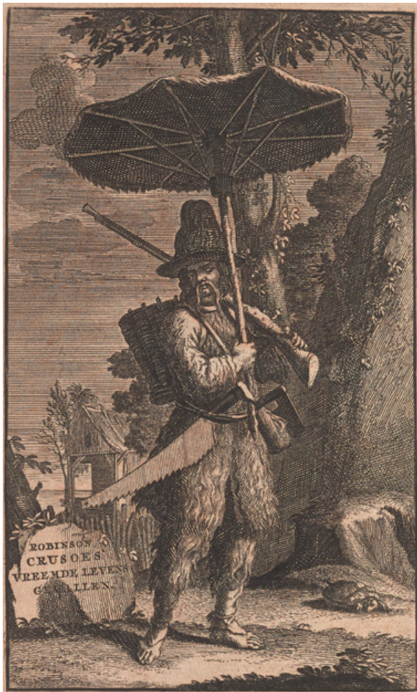
Figure 10 Adapted copperplate portrait frontispiece, Het Leven en Wonderbaare Gevalen van Robinson Crusoe (Amsterdam: de Jansoons van Waesberge, 1720). Reproduced from a copy in the Beinecke Rare Book & Manuscript Library, Yale University.