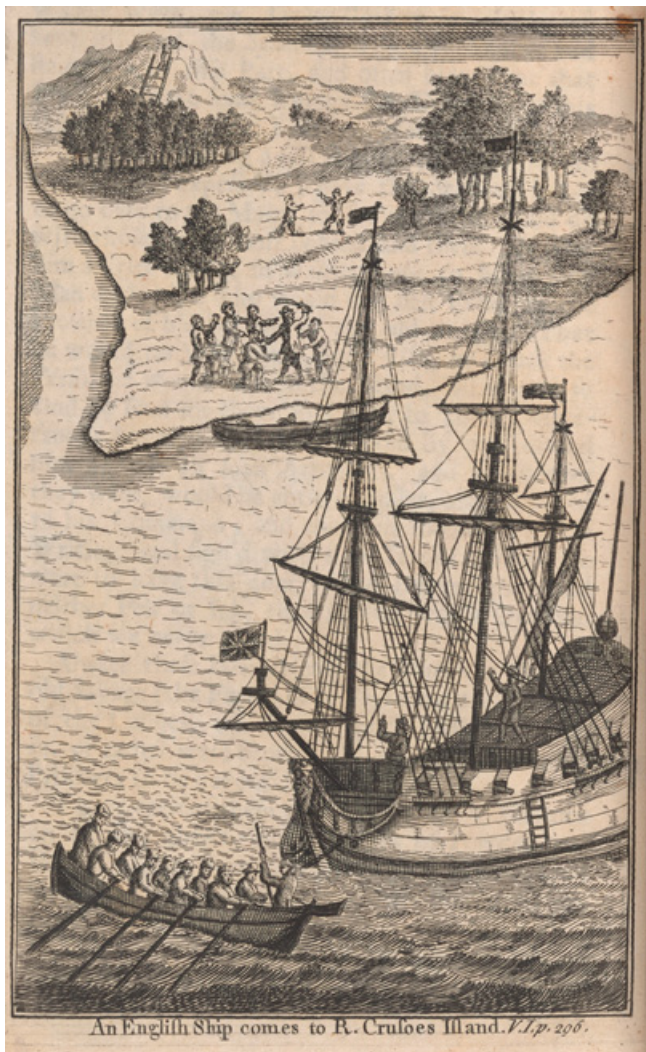
Figure 8 Copperplate of Crusoe saving the English captain, 1721 Taylor edition. Reproduced from a copy in the Beinecke Rare Book & Manuscript Library, Yale University.