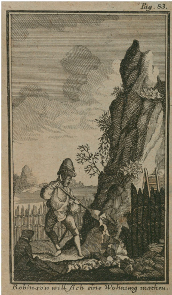
Figure 23 Copperplate depicting Crusoe constructing his home, Das Leben und die ganz ungemeyne Begebenheiten des Robinson Crusoe (Leipzig: J. C. Martini, 1720). Reproduced from a copy in the Beinecke Rare Book & Manuscript Library, Yale University.