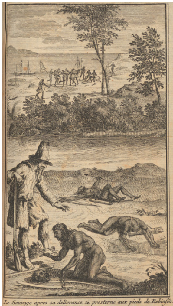
Figure 11 Copperplate of Friday's rescue, La Vie et les Aventures Surprenantes de Robinson Crusoe (Amsterdam: L'Honoré et Chatelain, 1720). Reproduced from a copy in the Beinecke Rare Book & Manuscript Library, Yale University.