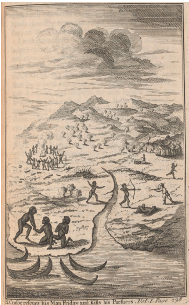
Figure 27 Copperplate of Crusoe rescuing Friday, 1721 Taylor edition.