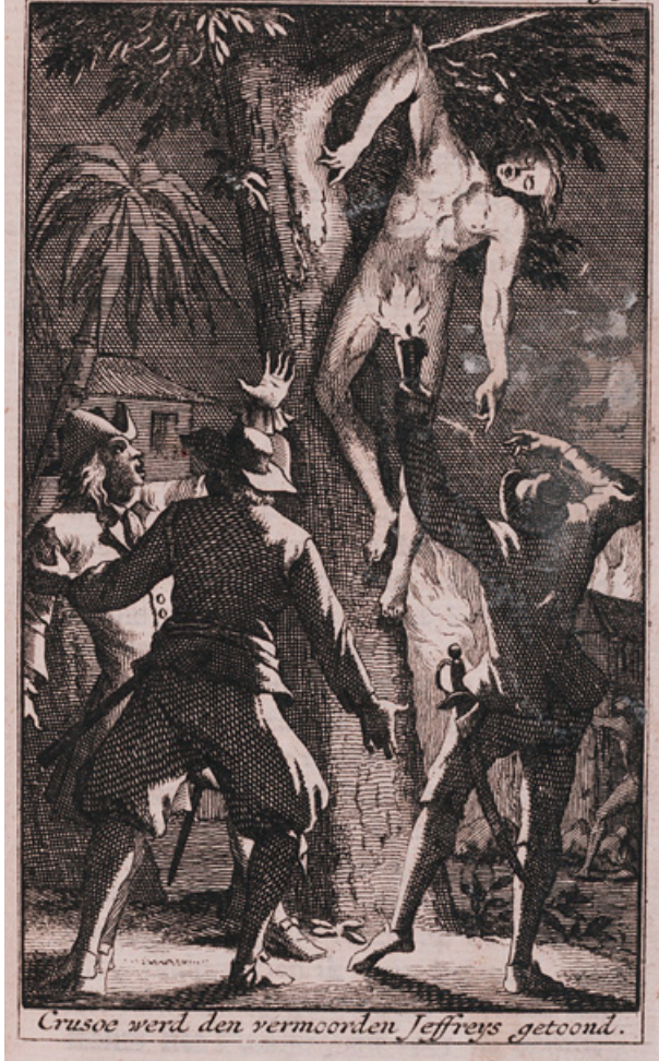
Crusoe werd den vermoorden Jeffreys getoond.

Figure 21 Copperplate of Crusoe being shown the murdered Tom Jeffry, Het Leven en Wonderbaare Gevallen van Robinson Crusoe (Amsterdam: de Jansoons van Waesberge, 1720). Reproduced from a copy in the Beinecke Rare Book & Manuscript Library, Yale University.