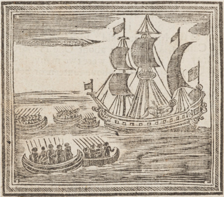
Figure 26 Woodcut depicting Friday's death, The Life and Adventures of Robinson Crusoe . . . The whole Three Volumes faithfully Abridg'd (London: A. Bettesworth, T. Brotherton and M. Hotham, 1722).

shift of mode to make sense of the dual narrative of the edition's text-image framework. As a result, illustrations may collectively have been understood as a narrative sequence that – if not replicating – intersected with the typographical narrative by highlighting (and, in the process, assigning significance to) some scenes in favour of others. Compared with Taylor's sixth edition, Midwinter's woodcut frontispiece and the twenty-nine woodcut vignettes were distributed across 376 pages of text, which comprised both parts of