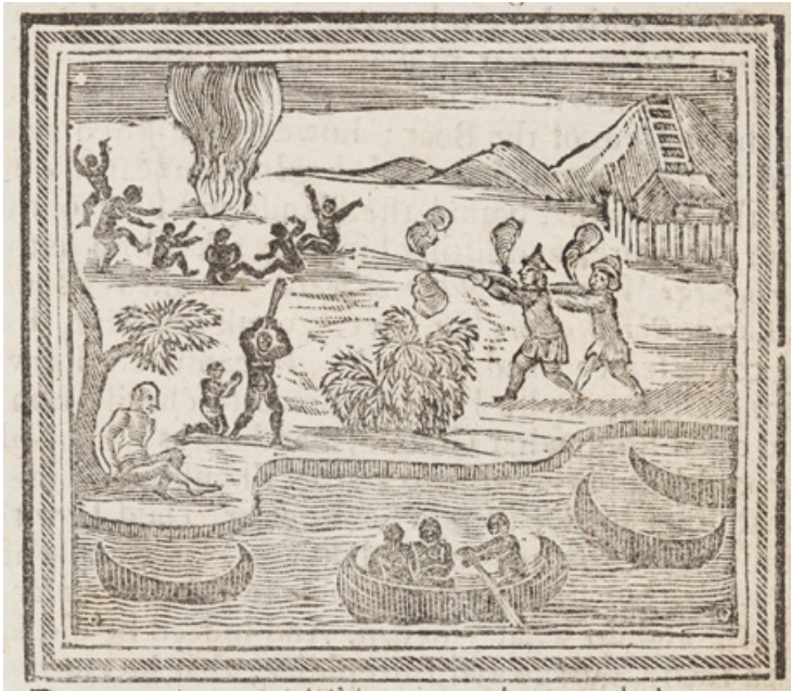
Figure 29 Woodcut rendering Crusoe and Friday killing the savages, The Life and Adventures of Robinson Crusoe . . . The whole Three Volumes faithfully Abridg'd (London: A. Bettesworth, T. Brotherton and M. Hotham, 1722).

only for reasons governing the interpretive relationship the image entertains with the printed text. But it is also technologically conditioned, for – unlike copperplates, which had to be printed on separate paper stock and could not be printed as part of the typeset text – the physical woodblock was set alongside the type and printed at the same time. The spatial placement of the illustration is thus meaningful, since the typesetter, if not instructed