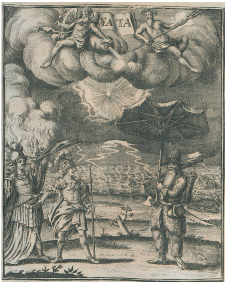
Figure 34 Copperplate frontispiece depicting Telemachus and Crusoe, Wundersame Erzählungen aus dem Reiche derer Todten (Frankfurt: Felßecker, 1739). Reproduced from a copy in the author's collection.