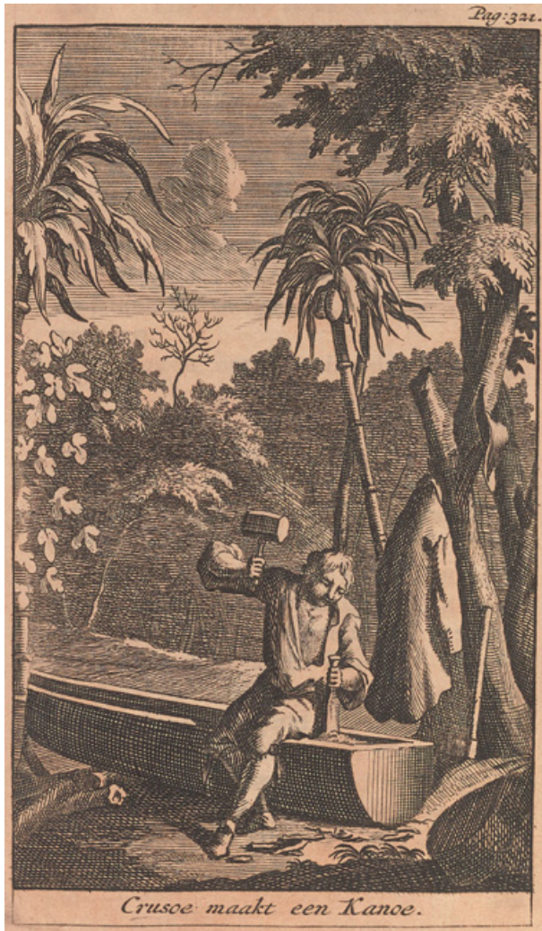
Figure 17 Copperplate of Crusoe constructing a boat, Het Leven en Wonderbaare Gevallen van Robinson Crusoe (Amsterdam: de Jansoons van Waesberge, 1720). Reproduced from a copy in the Beinecke Rare Book & Manuscript Library, Yale University.