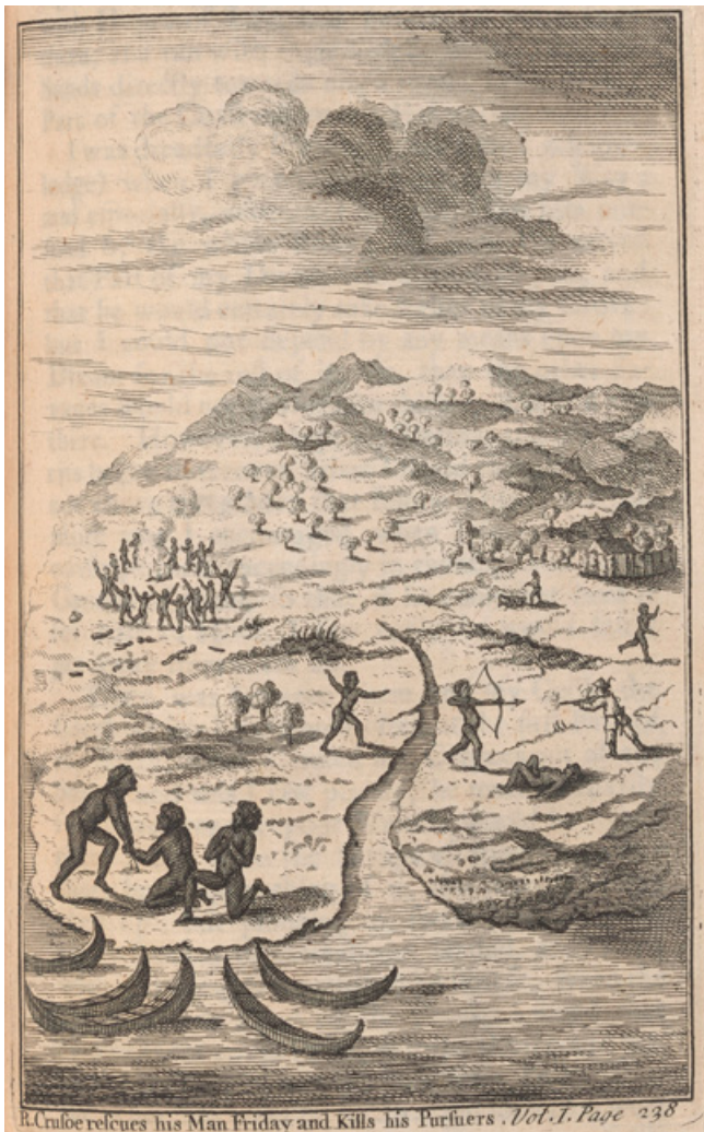
R. Crusoe rescues his Man Friday and Kills his Pursuers. Vol. I. Page 238