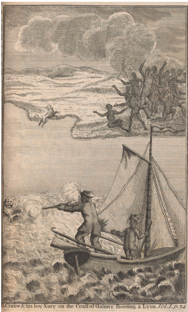
Figure 5 Copperplate of Crusoe shooting a lion, 1721 Taylor edition [sixth edition]. Reproduced from a copy in the Beinecke Rare Book & Manuscript Library, Yale University.