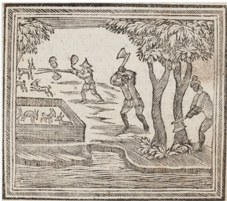
Figure 30 Woodcut of Friday and his father felling trees and the goats’ kids being taken to Crusoe’s enclosure, The Life and Adventures of Robinson Crusoe ... The whole Three Volumes faithfully Abridg’d (London: A. Bettesworth, T. Brotherton and M. Hotham, 1722). Reproduced from a copy in the Beinecke Rare Book & Manuscript Library, Yale University.

three activities – the cutting down of trees by Friday and his father, Crusoe’s shooting of ‘the wild Dams, and his bringing home their Kids to my Enclosure’ (166). Compared to the more extended narrative that had been reworked by the preceding woodcut, the illustration depicting Crusoe in the background and Friday and his father in the foreground visualizes merely two sentences from the text. The two moments narrated – the