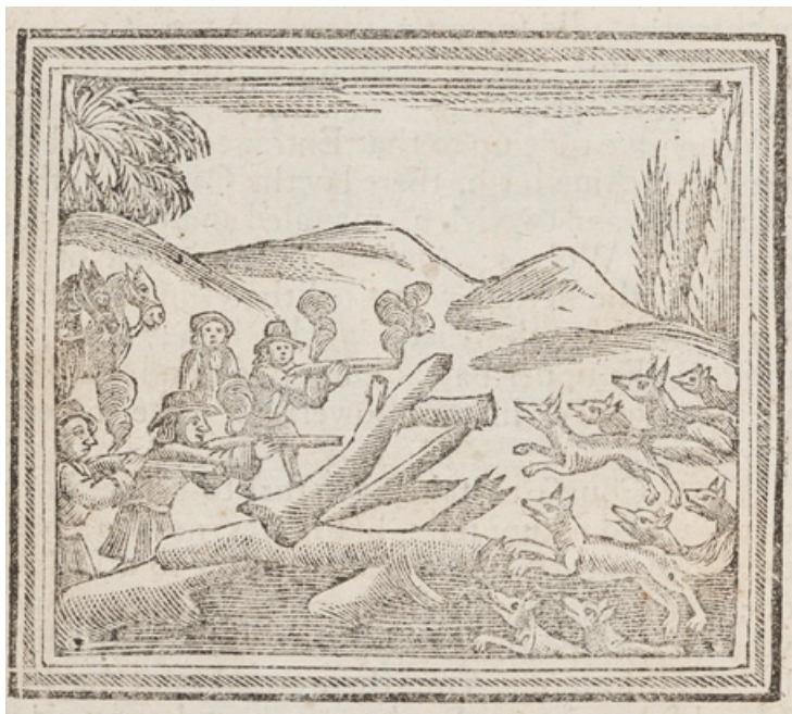
Figure 25 Woodcut depicting the attack of the wolves, The Life and Adventures of Robinson Crusoe... The whole Three Volumes faithfully Abridg'd (London: A. Bettesworth, T. Brotherton and M. Hotham, 1722).

capturing the actual scene rendered visually, the second narrating the result of the attack, on the part of the shooters: 'they killed several of the Wolves at the first Volley' (186), even though they need to continue firing, as the animals 'came on like Devils pushing one another with the greatest Fury' (186).