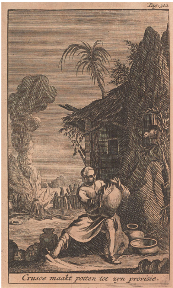
Figure 16 Copperplate of Crusoe as potter, Het Leven en Wonderbaare Gevallen van Robinson Crusoe (Amsterdam: de Jansoons van Waesberge, 1720).