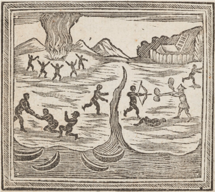
Figure 28 Woodcut of Crusoe rescuing Friday, The Life and Adventures of Robinson Crusoe . . . The whole Three Volumes faithfully Abridg'd (London: A. Bettesworth, T. Brotherton and M. Hotham, 1722). Reproduced from a copy in the Beinecke Rare Book & Manuscript Library, Yale University.

from his Pursuers. . . . Between them and my Castle there was a Creek, that very same where I sail'd into with all my Effects from the Wreck of the Ship, on the steep Banks of which, I very much fear'd the poor Victim would be taken. . . . But soon was I out of Pain for him, when I perceiv'd he made nothing of it, tho' at full Tide. . . . The other Savage seeing his Fellow fall, stopt as if he had