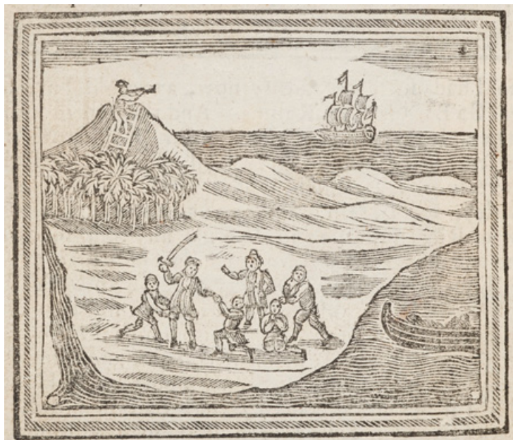
Figure 31 Woodcut depicting Crusoe observing the mutineers' treatment of their captives, The Life and Adventures of Robinson Crusoe . . . The whole Three Volumes faithfully Abridg'd (London: A. Bettesworth, T. Brotherton and M. Hotham, 1722).

The reader, not possessed of a means to zoom in on the group of mutineers and captives, primarily needs to recognize their representational roles. The mode of their realization – one figure brandishing a sword, while two figures are on their knees – conveys their status alternately as mutineer and prisoners. Crusoe's account offers a focused act of interpretative perception that provides the qualified assessment which the medium, rendering the figures at such a small size and without nuanced expressiveness, is