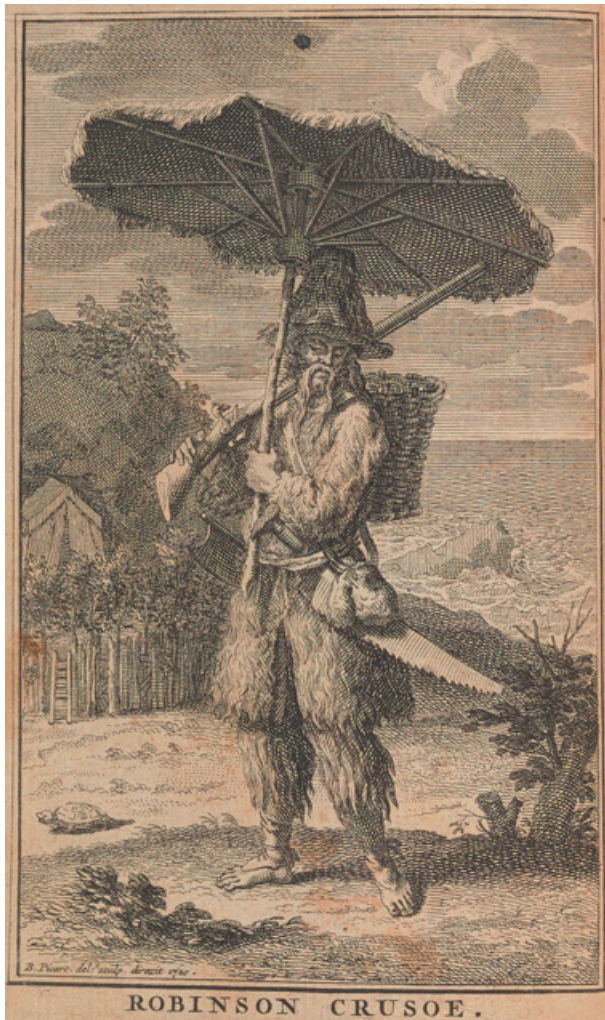
Figure 9 Copperplate portrait frontispiece, designed and executed by Bernard Picart, La Vie et les Aventures Surprenantes de Robinson Crusoe (Amsterdam: L'Honoré et Chatelain, 1720). Reproduced from a copy in the Beinecke Rare Book & Manuscript Library, Yale University.