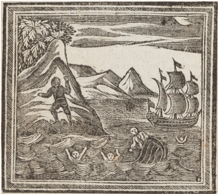
Figure 24 Woodcut depicting Crusoe’s shipwreck, The Life and Adventures of Robinson Crusoe . . . The whole Three Volumes faithfully Abridg’d (London: A. Bettesworth, T. Brotherton and M. Hotham, 1722). Reproduced from a copy in the Beinecke Rare Book & Manuscript Library, Yale University.

Two woodcuts – one visualizing Crusoe’s shooting of the leopard, the other Crusoe and Xury continuing their journey and seeing on the shore natives ‘black and stark naked’ (Defoe, 1722, 16) – precede the illustration of the shipwreck that will lead to the desert island narrative (Figure 24). This woodcut goes beyond traditional renderings of shipwrecks, as it offers a progressive-diachronic map of actions and events: read from right to left, the ship – still intact – shortly after ‘struck upon Sand, and in a Moment the