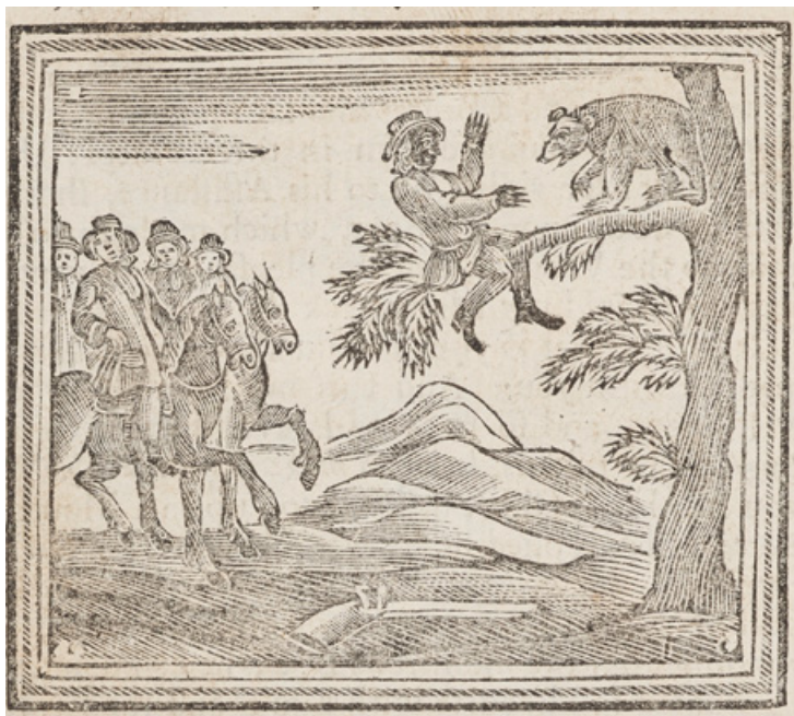
Figure 32 Woodcut depicting Friday and the bear, The Life and Adventures of Robinson Crusoe.. The whole Three Volumes faithfully Abridg'd (London: A. Bettesworth, T. Brotherton and M. Hotham, 1722).

looked to an earlier design of a battle engagement that appeared in The English Hero: or, Sir Francis Drake Reviv'd (1695) and The Noble and Renowned History of Guy Earl of Warwick (1711). Midwinter's illustrator followed the general structure of a profile view of soldiers fighting but amplified it through the addition of arrows flying in the air, a placing into relief of the different kinds of weapons, a juxtaposition between the spears and lances, on the one hand, and the bows and arrows, on the other. The