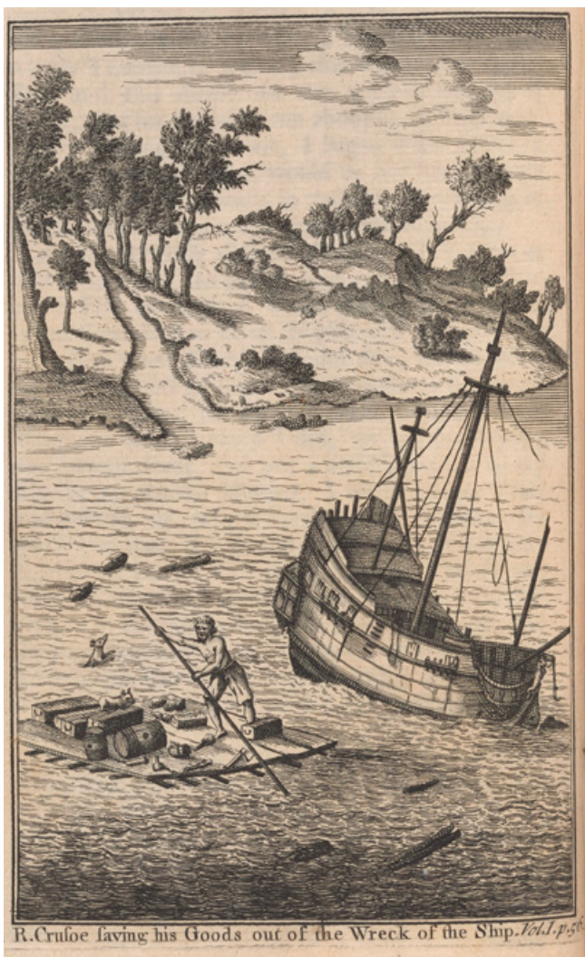
Figure 6 Copperplate of Crusoe salvaging goods from the wreck, 1721 Taylor edition [sixth edition].