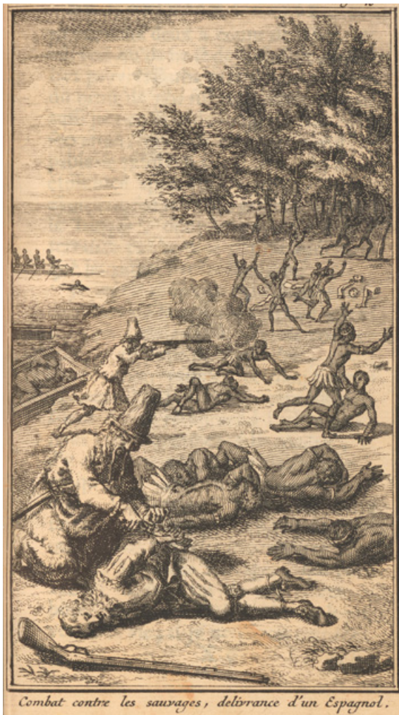
Figure 12 Copperplate of Crusoe's killing the savages and his delivery of the Spaniard, La Vie et les Aventures Surprenantes de Robinson Crusoe (Amsterdam: L'Honoré et Chatelain, 1720). Reproduced from a copy in the Beinecke Rare Book & Manuscript Library, Yale University.