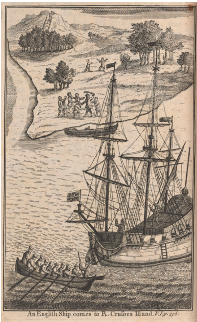
An English Ship comes to R. Crufoes Island. V. 1. p. 206.

Figure 8 Copperplate of Crusoe saving the English captain, 1721 Taylor edition. Reproduced from a copy in the Beinecke Rare Book & Manuscript Library, Yale University.