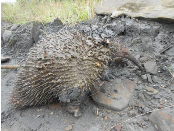
PLATE 1 Living western long-beaked echidna Zaglossus bruijnii encountered near Bangun Mulia village, Teluk Bintuni Regency (record 4 in Table 1).

Record 2 was from an interviewee who found the echidna near Wasian, adjacent to the river. Record 3 was captured by two local hunters from Bangun Mulia and Mogoi Baru, south-west of Tembuni adjacent to the Sidua River at 57 m altitude. Record 4 was found by a hunter from Araisum, in swamp forest close to Bangun Mulia, while checking hunting traps. The typical habitat in which these three individuals were found was lowland forest close to small creeks flowing into the Sidua River. The most common tree species in these areas are merbau Intsia bijuga , pulai Alstonia scholaris , nyatoh Palaquium sp. and medang Litsea timoriana . The sites were muddy, with numerous fallen and rotting trees and with the forest floor covered by scrub, forage and hollow logs, which are suitable for echidna burrows.