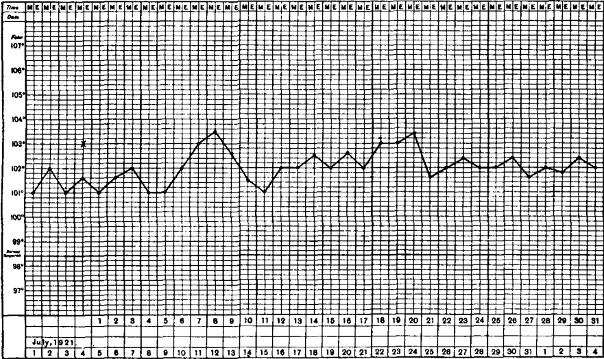
Chart 1. M. rhesus ♀ immunised with B. abortus and afterwards infected with B. melitensis .

The experiment shows quite clearly that the immunisation of Monkey No. 1 (Rhesus) with B. abortus , had been able to protect that monkey against an infecting dose of B. melitensis , which in the control non-immunised Monkey No. 2 (Sinicus) produced a quite definite febrile illness.