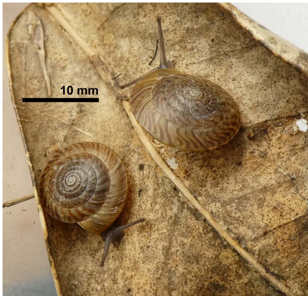
PLATE 1 Two adult-sized greater Bermuda land snails Poecilozonites bermudensis on Port's Island, Bermuda (Fig. 1).

the feature in a random direction. Control sites were a similar distance from the sea and within the same plant community, but without rocks, C. equisetifolia trees or large amounts of C. equisetifolia litter.