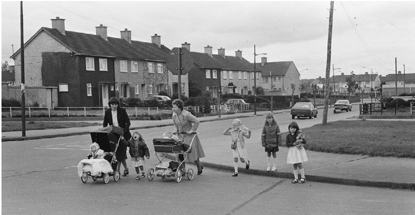
I.1 Heavy Traffic (2) , Ballyfermot, Dublin, June 1981.

personal experiences of individuals and activists. 107 It aims to illustrate that the Irish history of contraception was not exceptional, but that Irish men and women had much in common with the experiences of individuals in other predominantly Catholic European countries, such as Italy, Spain and Switzerland, as well as the experiences of individuals in regions which did not have the same legal restrictions on contraception such as Quebec, England and the United States. 108 Finally, the book argues that unlike other countries, Ireland did not experience a sexual revolution until at least the 1990s. I argue that the Family Planning Act of 1979 was not a turning point, and that restricted access to contraception, and shame and stigma around sexual matters more generally, persisted until at least the 1990s, if not beyond.