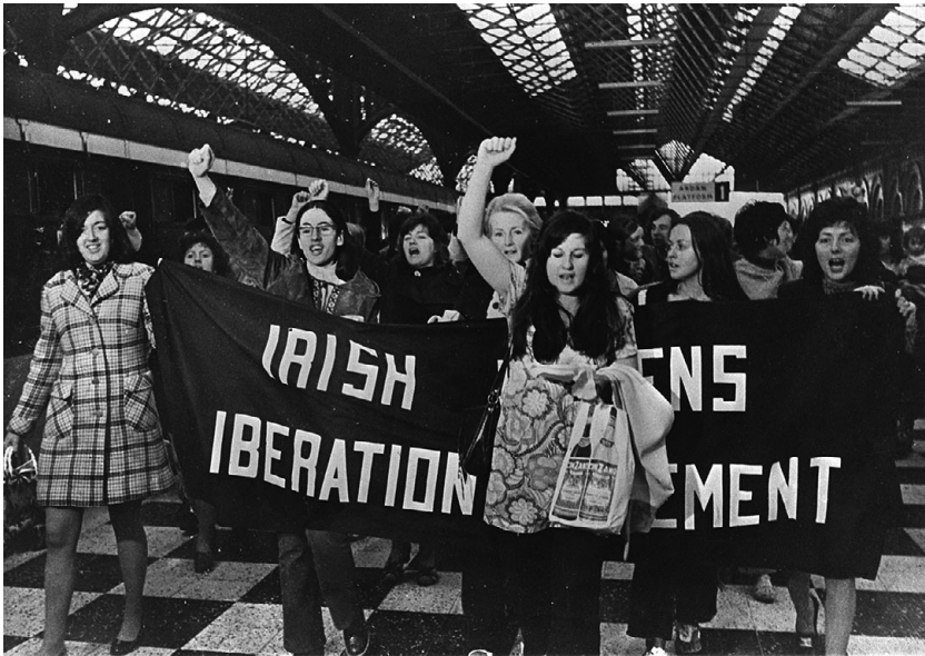
Figure 7.1 Irish Women's Liberation Movement Contraceptive Train protest, 22 May 1971.