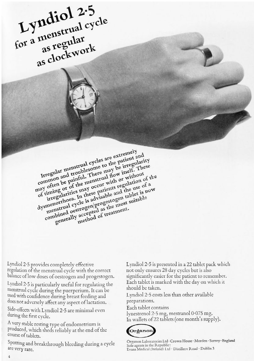
Figure 4.1 Advertisement for Lyndiol 2.5, Journal of the Irish Medical Association , volume LX, no.365, November 1967.