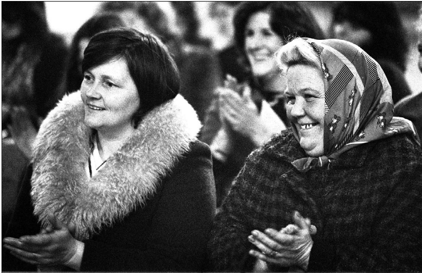
Figure 7.3 Two women in the audience at CAP public meeting in Ballyfermot, Dublin on 21 March 1978.

the Irish press. 95 Signature campaigns were also utilised by the group. CAP members remarked in Wicca magazine that in the course of collecting signatures for a national campaign, they were ‘saddened and shocked at the appalling ignorance because of lack of access in information and education and unavailability of Family Planning’. 96