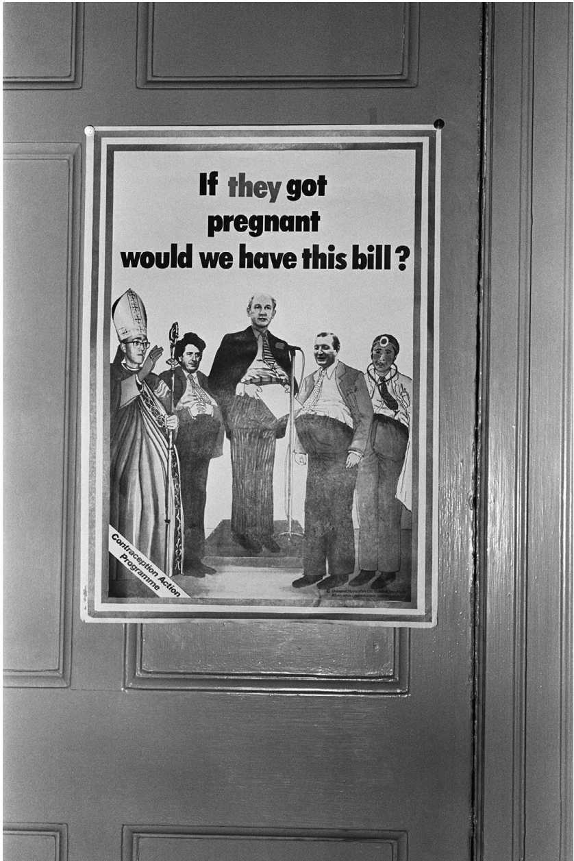
Figure 7.6 CAP poster, Limerick Family Planning Clinic, July 1981. Photograph by Beth Lazroe. All rights reserved, DACS 2022.