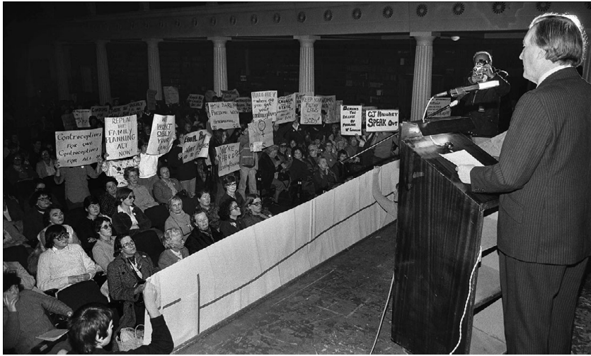
Figure 9.1 Protest during Taoiseach Charlie Haughey's speech at the opening of the National Forum on the UN Decade for Women 1975–85, Dublin, 15 November 1980.