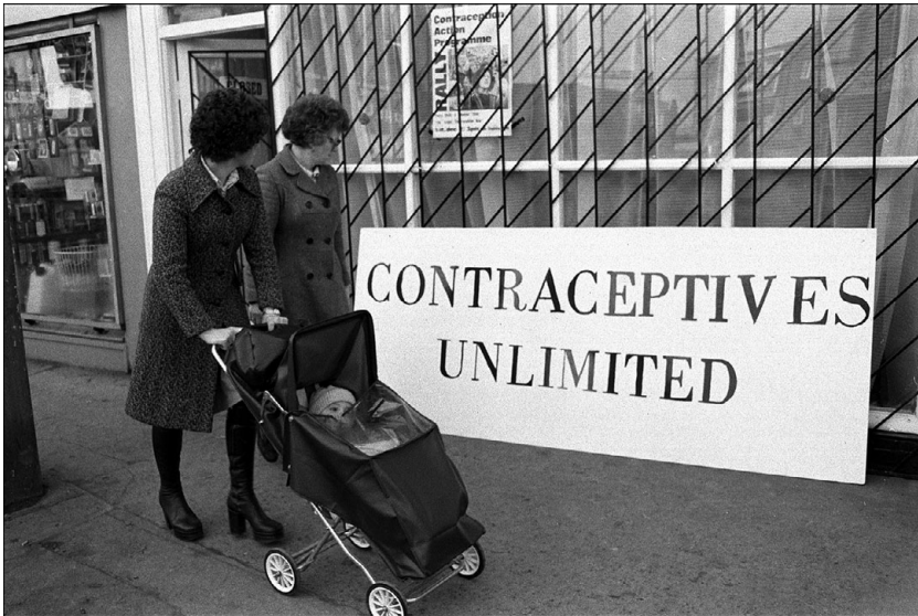
Figure 7.7 Front of Contraceptives Unlimited shop, Dublin, 28 November 1978.