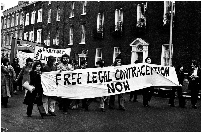
Figure 7.10 CAP march in Dublin, 3 December 1978.

Evidently, in spite of the introduction of the Family Planning Act in 1979, the issue of contraception remained controversial and divisive.