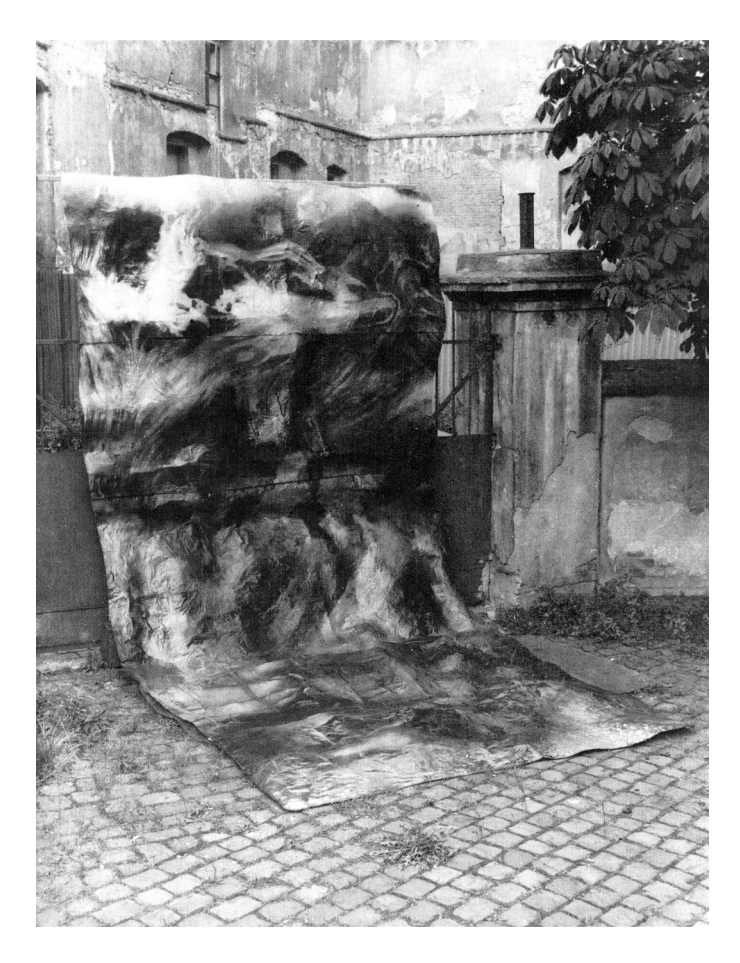
Figure 5. Nadja Rawa, K obrazu svému / In Your Own Image, 1987, mixed media, 680 x 260 cm, © Nadja Rawa

Yugoslavia).<sup>57</sup> Regardless of the medium, more male, sometimes chauvinistic groups, such as Łódź Kaliska in Poland, began to assert themselves in the east as part of the neo-avant-garde or counterculture of the period.<sup>58</sup> On the other hand, it certainly did not change the fact that women artists in socialist countries pursued postmodern painting and sculpture. Many of my interviewees also worked with postmodern approaches or aesthetics. Bohuslava Olešová, Marie Birchler Suchánková, and Eva Prokopcová made large-format expressive color objects and drawings. Nadja Rawa mixed styles between painting, photography, and objects. Eva Vejražková focused on "wild" paintings outside the rectangular format that were transformed into installations (Figure 5).