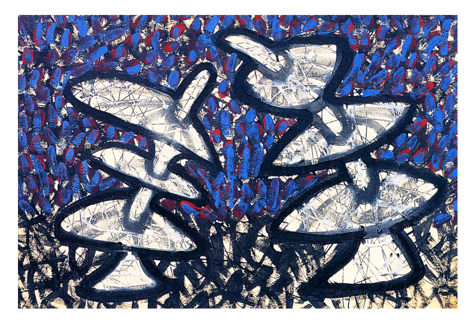
Figure 2. Marie Birchler Suchánková, Dialog I Dialogue , 1985, mixed media on paper, 105 x 85 cm, © Marie Birchler Suchánková

the fact that someone (a parent, an authority in the field, a person with a political or institutional position) "vouched" for the applicant, then there could be a kind of "quid pro quo" (financial bribe or "consideration" for medical services) or even a kind of political blackmail.<sup>29</sup> The art academies themselves functioned as an inherently elite environment, and it