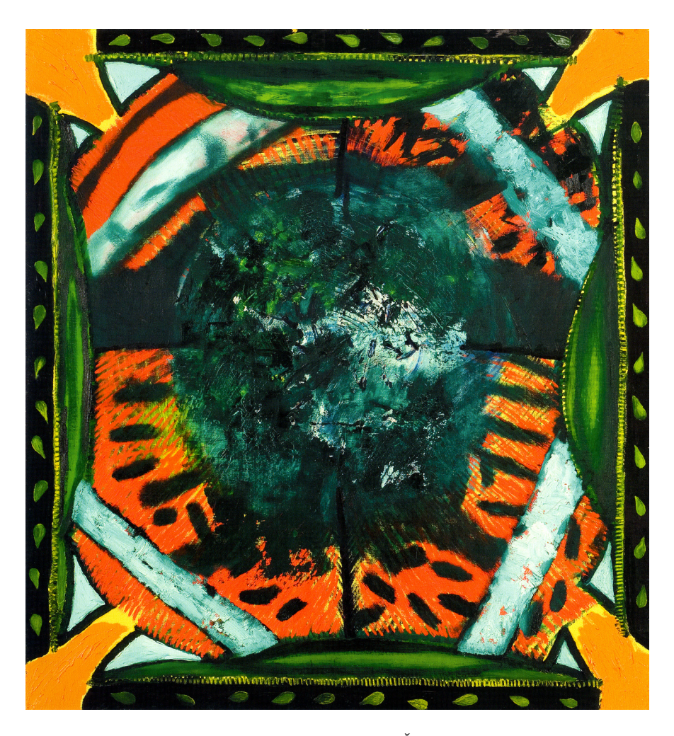
Figure 3. Eva Prokopcová, Zevnitř ven / From the Inside Out (cyklus Čtverce / Square series), 1987, oil on canvas, 100 x 90 cm, © Eva Prokopcová

was considered a career achievement for an applicant, some of whom applied for eight years in a row, even to be accepted.