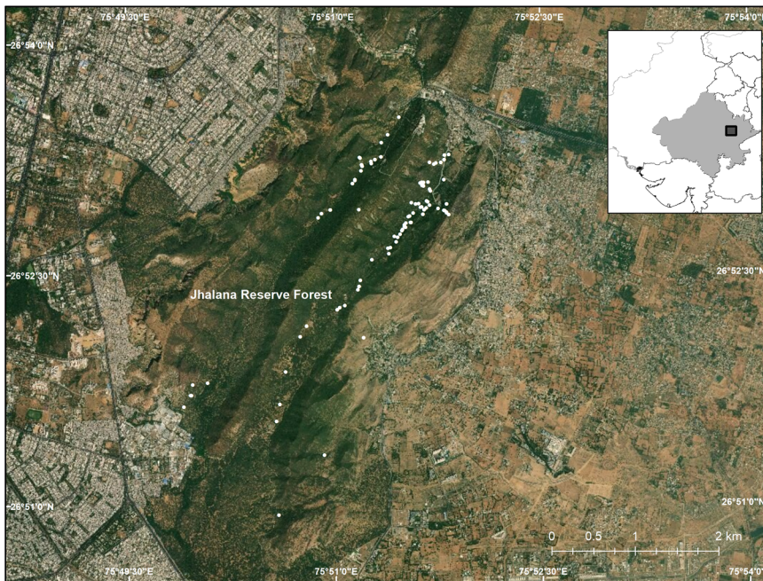
FIG. 1 Jhalana Reserve Forest in north-west India, and the surrounding city of Jaipur, with the locations of the leopard Panthera pardus fusca scats collected.

often feed opportunistically on easily accessible domestic prey (Athreya et al., 2013, 2014). We thus hypothesized that the leopards' diet comprises principally of domestic animals. Our objectives were to identify the leopards' key prey species and examine their importance for human-leopard coexistence and acceptance of the presence of leopards in the urban landscape (Kumbhojkar et al., 2019).