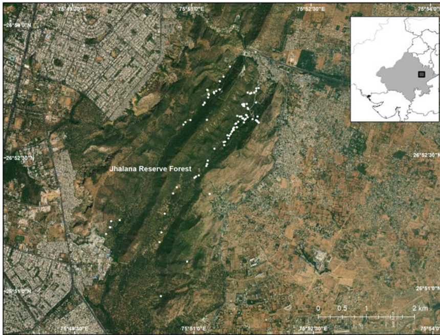
FIG. 1 Jhalana Reserve Forest in north-west India, and the surrounding city of Jaipur, with the locations of the leopard Panthera pardus fusca scats collected.

often feed opportunistically on easily accessible domestic prey (Athreya et al., 2013, 2014). We thus hypothesized that the leopards' diet comprises principally of domestic animals. Our objectives were to identify the leopards' key prey species and examine their importance for human-leopard coexistence and acceptance of the presence of leopards in the urban landscape (Kumbhojkar et al., 2019).