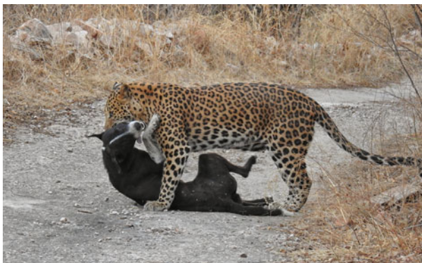
PLATE 1 Leopard Panthera pardus fusca preying on a domestic dog that strayed into the boundaries of Jhalana Reserve Forest.

2 Y, mass of prey consumed per scat; D, relative biomass; E, relative per cent of each prey species consumed (see text for further details).