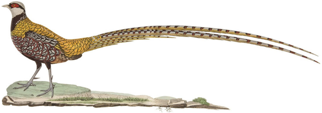
Figure 2. The 'Faisan Vénéré', from Temminck's Nouveau Recueil de Planches Coloriées D'Oiseaux (Paris, 1838).

Nouveau Recueil de Planches Coloriées D'Oiseaux , published in 1830, Temminck, believing that his tailfeathers did not belong to P. superbis , provided a detailed description of his new pheasant species, which he named the 'Faisan Vénéré' ( Phasianus veneratus ), reiterating his Chinese restriction claims by explaining that this very rare bird, 'from the outermost reaches of the Empire', was kept in the aviaries of wealthy Chinese and was very valuable, its exportation prohibited under severe punishment. 18