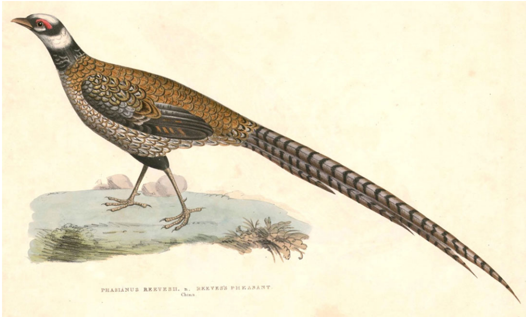
Figure 3. The image of Reeves' pheasant in Gray's Illustrations of Indian Zoology (London, 1832), based on an image supplied by John Reeves.