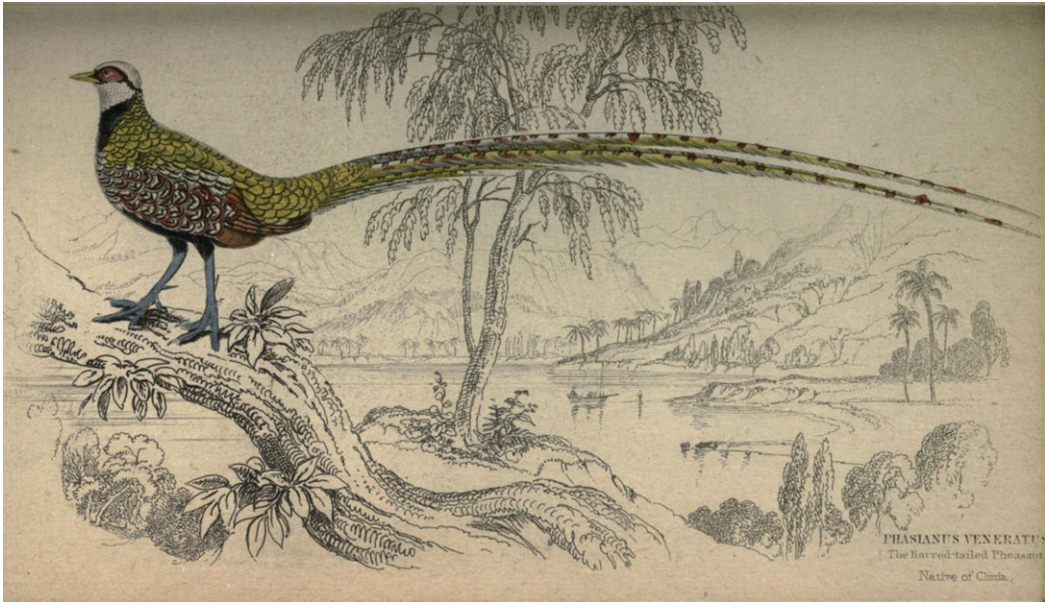
Figure 4. The illustration of Reeves' Pheasant in Jardine's The Naturalist's Library (Edinburgh, 1834).

pheasants at his seat, Stanmore Priory, near Edgware' before being donated to the ZSL in 1864. 42 The ASGB similarly boasted a single, 'nearly pure-bred cock Reeves' pheasant' in 1864. 43 Indeed, Reeves' pheasant continued to be regarded as very rare in Britain well into the 1860s, with one popular work of ornithology, published in 1863, stating that although the species was present in Britain, it did not exist in sufficient quantities to warrant the status of a 'British' bird. 44 Owing to their very small numbers and high-value status, specimens were mostly confined to aviary and domestic environments in Britain, which ensured that contemporary encounters with the species continued to occur in similar spaces to those previously observed in China. Consequently, new encounters with Reeves' pheasant in Britain tended to reinforce earlier imaginings of the species as a beautiful, rare, and valuable aviary bird.