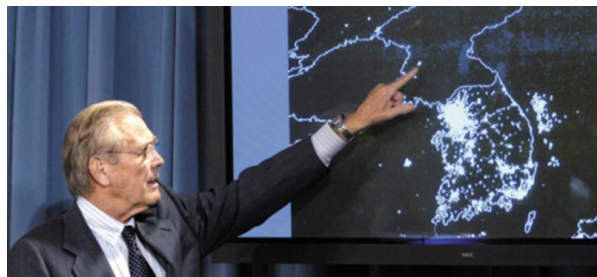
U.S. Defense Secretary Donald Rumsfeld points to a satellite image of the Korean peninsula at night in a 2005 Pentagon press briefing