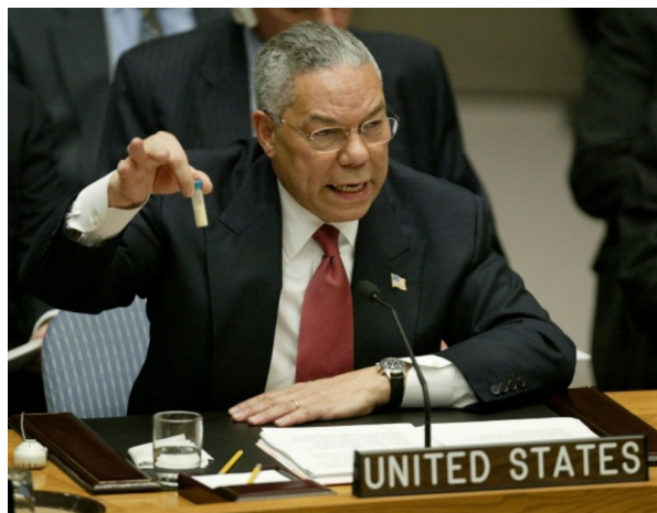
Colin Powell, at the United Nations on February 5, 2003, making the case for U.S. war in Iraq

of the axis of evil, the proclivity to securitize human rights relative to North Korea has in no way abated. Human rights were transformed during the George W. Bush era into a defining U.S. policy instrument toward North Korea. This era would moreover spawn a coalitional spectrum of anticommunist, neoconservative, evangelical, and defector-based NGOs in both the United States and South Korea. 73 Indeed, the past decade has been witness to the consolidation of a U.S.-funded transnational advocacy, propaganda, and intelligence network under the elastic banner of North Korean human rights. Tellingly, the two primary ways of knowing North Korea within today's implicitly militarized human rights frame are through forms of intelligence whose reliability is far from assured—specifically, defector testimony and satellite imagery, referred to as human intelligence (Humint) and imagery intelligence (Imint), respectively, in intelligence circles. Both forms of “evidence,” we might be reminded, were central to then-Secretary of State Colin Powell's supposedly airtight case for U.S. intervention in Iraq, which he delivered before the UN Security Council in 2003.