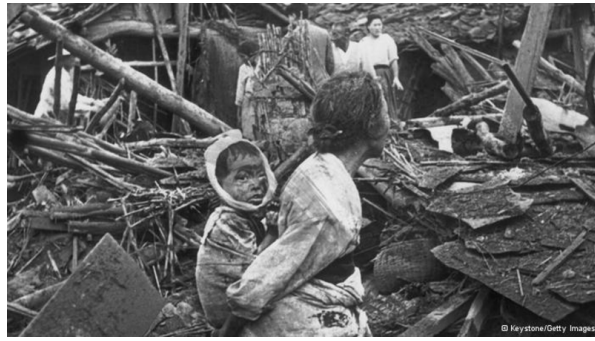
Pyongyang, North Korea, in the aftermath of an air raid by U.S. planes in fall 1950. A total of 420,000 bombs eventually would be dropped on a city that then boasted approximately 400,000 residents.

As Césaire would trenchantly comment in Discours sur le colonialisme (1955), “capitalist society...is incapable of establishing a concept of the rights of all men”—and further noted that it degrades humans by subjecting them to “thingification.” 49 Césaire’s critique begins to alert us to a “major deficiency in the doctrinal analysis of international law,” namely, “that no systematic undertaking is...offered of the influence of colonialism in the development of the basic conceptual framework of the subject.” 50 Indeed, the very “edifice of international law embed[s] relations of imperialist domination.” 51 It is thus no coincidence that the various human rights vernaculars—anticolonial, race radical, communitarian, Third World—that flashed up during the Cold War with visions of “a humanism made to the measure of the world,” have today been relegated to the status of “rebellious specters” in the dominant paradigm of international human rights. 52 That the liberal model of rights has prevailed in this era of advanced global capitalism “as the privileged ideological frame through which excessive cruelty [is] conceived and interpreted” has meant the neutralization, as Randall Williams has argued, of “other epistemic forms and political practices.” 53 On the institutional