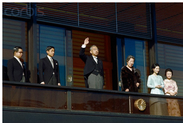
Scene of the Pachinko Ball Attack, Emperor Hirohito at the Imperial Palace, New Year 1969