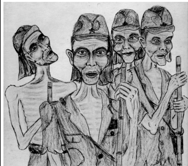
A picture drawn by one of the surviving soldiers in New Guinea

Okuzaki and his fellow soldiers of the 36 th IER and other troops of the 18 th Army began at this point. When they reached Wewak in January 1944, they were ordered to retreat further west to Hollandia in West (Dutch) New Guinea, 400 kms from Wewak. There was a Japanese base in Aitape, which was located almost half way to Hollandia. Yet, as mentioned above, the Japanese bases in Aitape and Hollandia were attacked and taken over by the Allied forces well before the Japanese troops even reached Aitape. 13