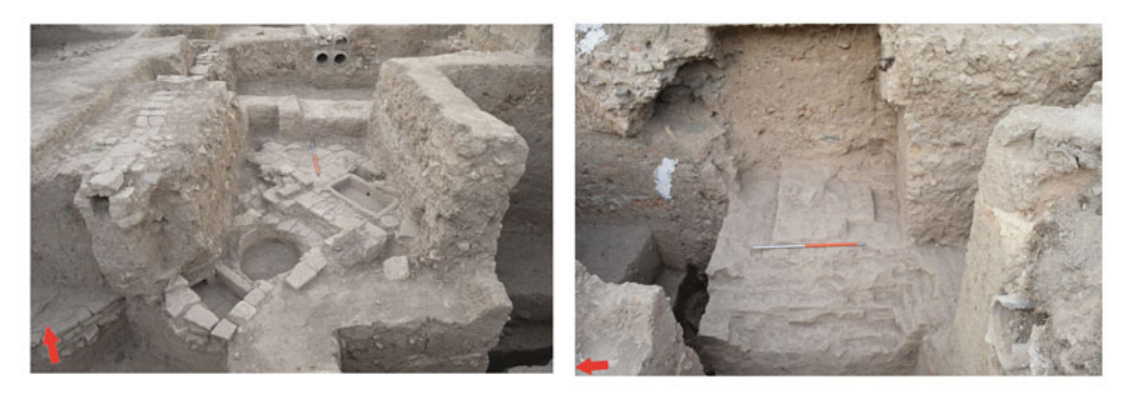
Figure 5. Some of the archaeological discoveries in the northern parts of Jahānnamā Palace (left); overlapping structures of stone and brick related to the pre-Safavid era, which subsequently appear to have been reused as the foundations for the Safavid-period palace (right); the remains of an oven are also on the right of this structure.