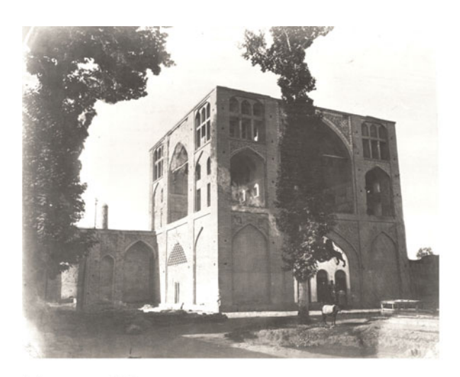
Jahan nama Palace Golestan Palace Album House, Album 199, number 8