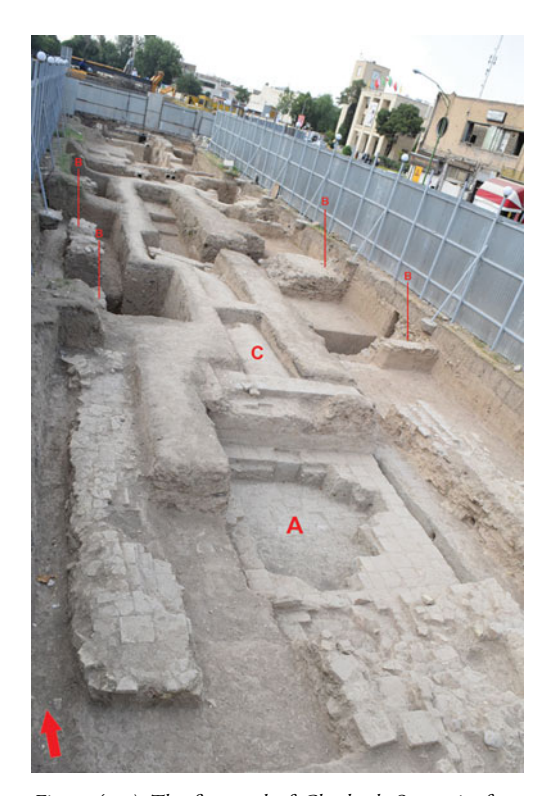
Figure 4. a) The first pool of Charbagh Street, in front of the Jahānnamā Palace; b) four footings of Jahānnamā Palace; c) water channel for the Charbagh stream.

lying at the start of the avenue, was positioned on the central axis of the palace and about 2.5m distant from it; this matches Chardin's (1811) description (Figure 4). Flowing from