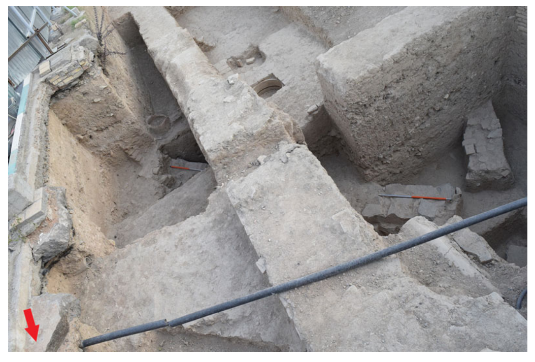
Figure 3. Parts of the coffeehouse located in the northern part of the area under investigation. The walls are mud-brick and pisé. Beneath this structure is an earlier diagonal stone wall between 0.3 and 1m in height.