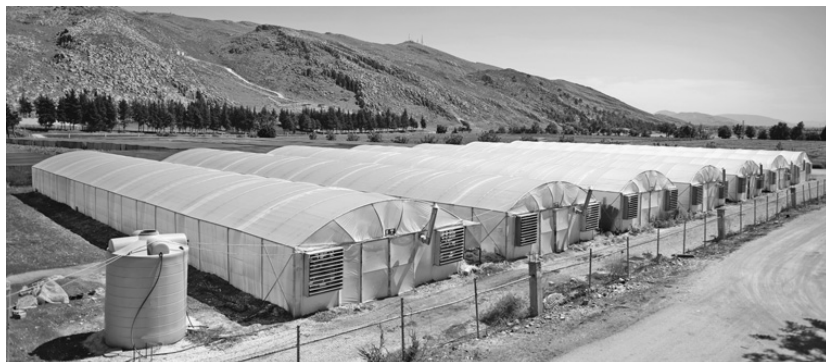
Figure 1.3 A row of greenhouses at ICARDA's research station and "temporary headquarters" (since 2012) in Terbol, Lebanon, 2018.

projects to make agrarian networks in the Eastern Mediterranean amenable to extraction. As the competition of Ottoman and French visions for agricultural productivity was made inert by the post–World War I fracture of the land into French and British mandate regions, the succeeding order facilitated intensified extraction according to technocratic and capitalistic forms of land and resource management. 58 The cumulative destabilization of land tenure systems, fragmentation of trade networks, and reintegration of territory into a nation-state divided between Mediterranean coastal plain and Syrian desert had created the preconditions for political, economic, and sectarian crisis. These same conditions provided the justification for renewed attention to agricultural development projects, framing the problem as one of low productivity with climatic and cultural causes.