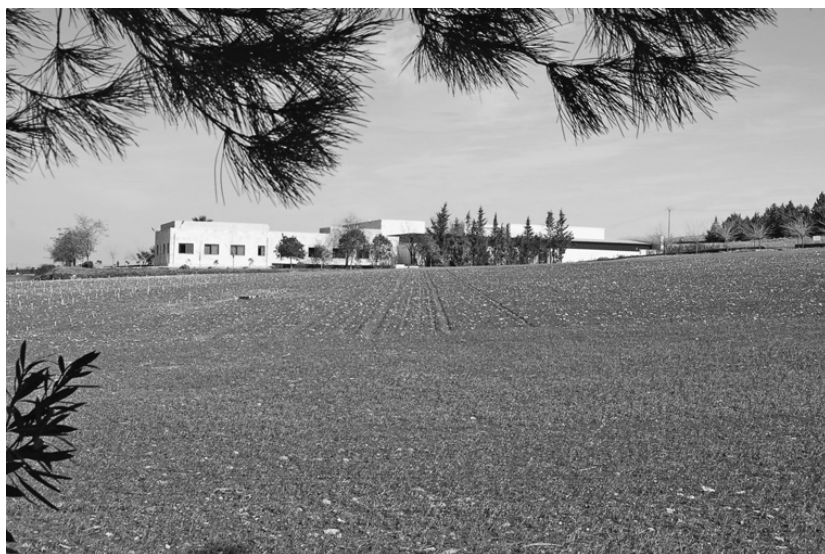
Figure 1.1 A view of ICARDA's facilities in Tal Hadya, Syria, 2007.

Born of the Cold War, ICARDA emerged from exercises of European imperialism, Great Power rivalries, and the concomitant restructuring of a patchwork of modern nation-states in Western Asia and North Africa. In the aftermath of World War II and European withdrawal from formal governance, newly independent nation-states became battlegrounds of the Cold War. The southern rim of Asia, which provided a buffer to the Soviet Union, became a focus of US strategies of containment from the 1950s. Scholars have attended to the global movement of soldiers, arms, and aid that fueled Cold War conflict in the “killing fields” of the Asian rim. 3 They have paid less attention to the ways in which the institutional development of international research organizations served Cold War objectives. 4 The founding of ICARDA was part and parcel of the