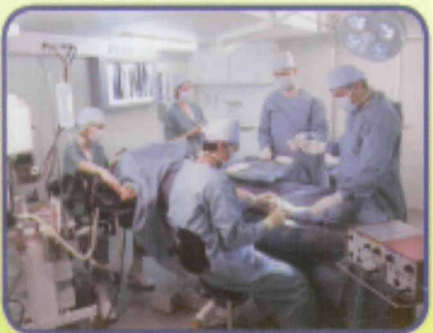
NorBase single and expandable containers