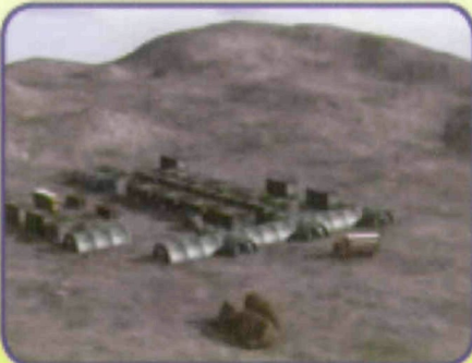
Norlense inflatable tents