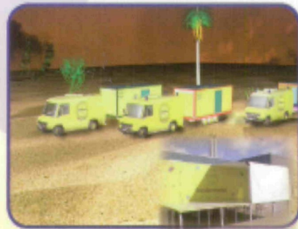
All kinds of Mobile Clinics