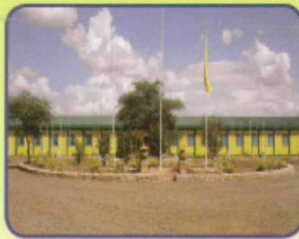
KATIKO Referral Hospital, Southern Sudan