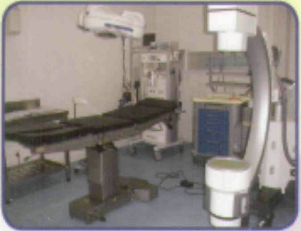
Inside OT in KATIKO Referral Hospital