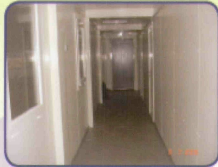
Inside MSF Hospital in Hattian Bala

Number One in the world within partly and turn key solutions incl. Transportation, Erection, Management, Training, Maintenance, Education, Administration, Storage, Out sourcing, Medivac, etc.