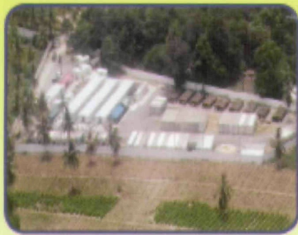
Thai Tsunami Victims Identification Centre