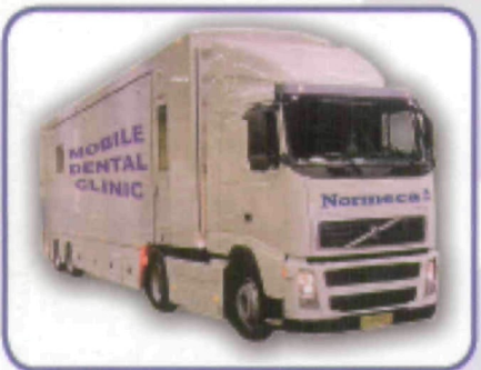
All kinds of clinics or hospitals in MultiSpace