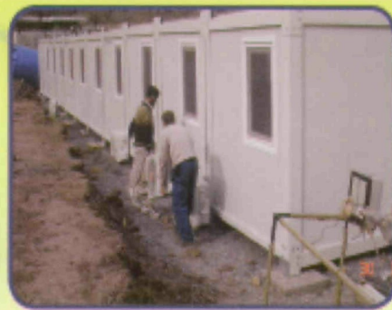
MSF Hospital, Hattian Bala, Pakistan