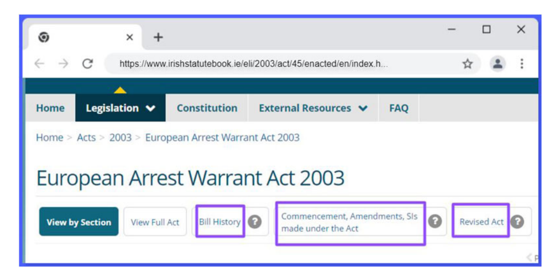
Figure 1: Research tools on eISB

'Commencements, Amendments button' attached to each Act (see Figure I). It lists the status of every section, its commencement date if commenced, as well as linking to the commencement provision. Note the 'updated to' date at the top of the page (see Figure 2). If any sections are listed as not yet commenced, the commencement information can be verified as up-to-date by browsing the latest statutory instruments (SIs) on eISB. At the time of writing, there are only 20 SIs after the 'updated to' date.