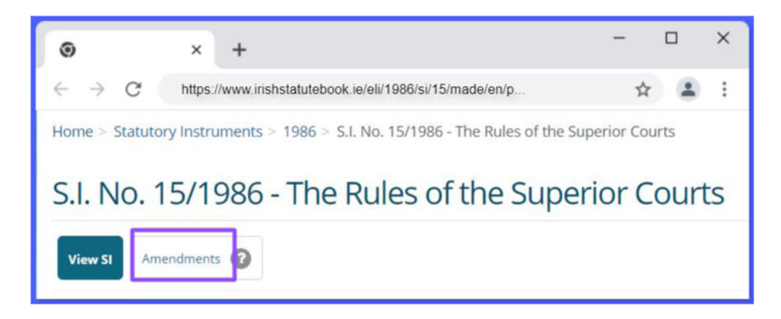
Figure 3: Amendments to statutory instruments are listed on eISB

Tracking is an area where subscription services offer more. Changes to particular legislation can be monitored on Better Regulation, albeit in selected areas such as company law, financial services law and employment law.