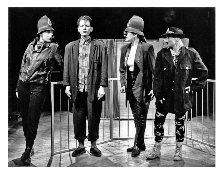
Figure 11 WICKED Wicked (1990) by Bryony Lavery, Oval Theatre.

immigration (it felt empty when the heart left but it's alright now, 2009, Lucy Kirkwood). This brief selection of plays illustrates some of the ways that Clean Break has invited publics to attend to the experience of women whose lives are often masked by stereotype and lazy cultural representation. They detail hidden backstories that shape individual women's experiences, reminding audiences, echoing Carlen, to not presume to always already know the detail of someone's life. They address hermeneutic injustices by providing collective interpretative resources for society to see, understand and respond to.