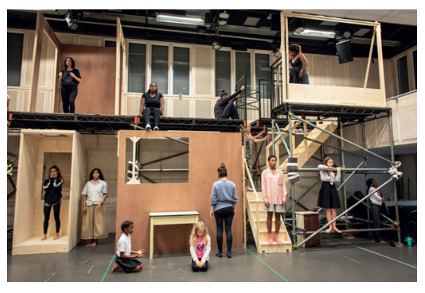
Figure 12 Rehearsal of [BLANK] (2019) by Alice Birch, Donmar Warehouse.

[BLANK], was co-commissioned by Clean Break and the Donmar Warehouse as part of Clean Break's fortieth anniversary celebrations. Within the Clean Break repertoire, the play had an usually large cast of potentially fourteen children, young people and adults. It also offered a distinctive form —