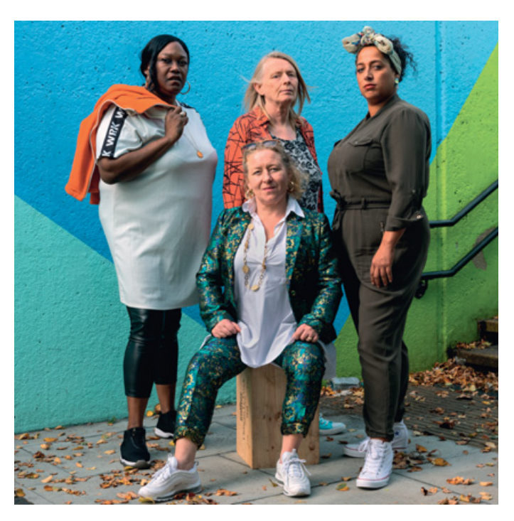
Figure 7 Inside Bitch (2019), devised by Clean Break Members with Stacey Gregg and Deborah Pearson, Royal Court.

Inside Bitch (2019), in form and content, playfully and rigorously critiques the ubiquity of popular cultural representations of women in prison that are reductive but influential – women who are 'bad', 'monstrous' and, as the extensive repertoire of prison sexploitation film titles illustrates, objectified and sexualised. Caged Heat (1974), Lust for Freedom (1987) and The Hot Box (1972 are merely a snapshot of an expansive genre of film, with posters featuring naked or scantily clothed women, with by-lines including 'women so hot with desire they