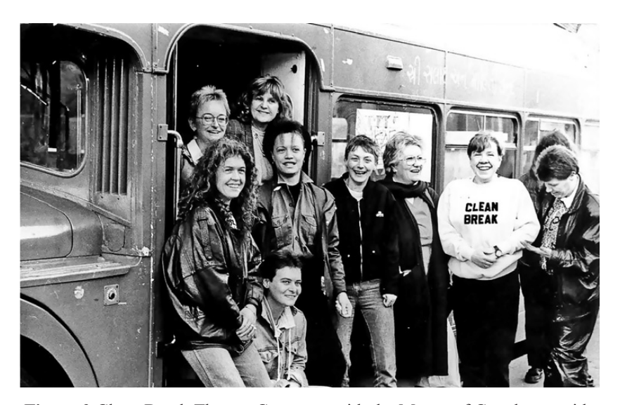
Figure 3 Clean Break Theatre Company with the Mayor of Camden outside HMP Holloway, 1986.

In this instance, founding then becomes a material act which Hicks articulates as creating a physical home for the company which has been a significant factor in Clean Break's endurance.