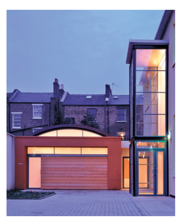
Figure 4 Clean Break Building at Night

As previously noted, Jenny Hicks was intent on getting the company into a building in order to give it a home (see Section 1.3). In its early