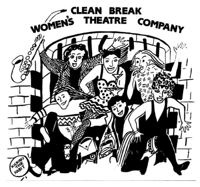
Figure 1 Clean Break Women's Theatre Company Image (1980)

detailed in Itzin's extraordinary British Alternative Theatre Directory of Playwrights, Directors and Designers (1983) are no longer in operation, there are many artists and a small number of companies, including Clean Break, who were part of this movement that continue to make explicitly political, socially engaged and applied performances in the early twenty-first century.