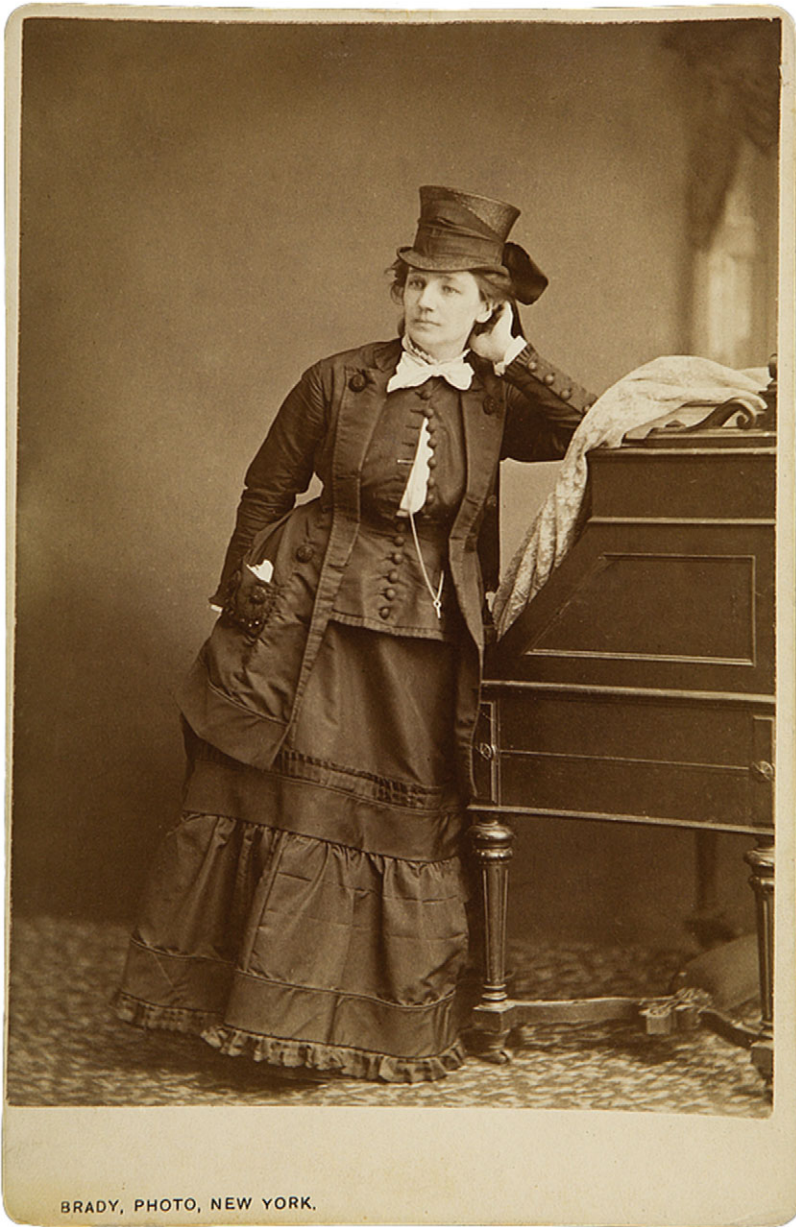
Figure 5. Mathew Brady, Victoria Woodhull, photograph, 1865–1873.

open around her breasts, which seems to subtly suggest that she borrowed this item from a man's closet. A light-colored bow at her throat adds to the dress's suit-like appearance. Her chain might be linked to a pocket watch, suggesting that her time matters. Woodhull leans against a wooden desk to demonstrate her preference for work