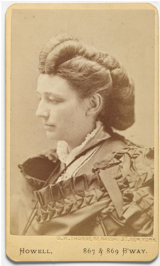
Figure 4. William R. Howell, Victoria Claflin Woodhull, photograph, circa 1865, National Portrait Gallery, Smithsonian Institution, Washington, D.C.

Woodhull made conservative choices for her session with Howell in comparison to those she made when she posed for the famous Mathew Brady. Brady, a New York City photographer and gallery owner, took Woodhull's portrait between 1866 and 1873 (Figure 5). Woodhull stands, looking into the distance, as with the previous picture. However, the similarities stop there. Here she wears masculine-inspired clothing. A top hat with a large bow in the back is perched on her head. The top of her dress features a long row of buttons that, in combination with her loose jacket with lapels, almost looks like a military uniform. The jacket even features a visible exterior pocket with what might be a handkerchief inside – a utilitarian feature, rather than decorative or almost entirely hidden, that was not common in women's fashions. Eight buttons appear to be