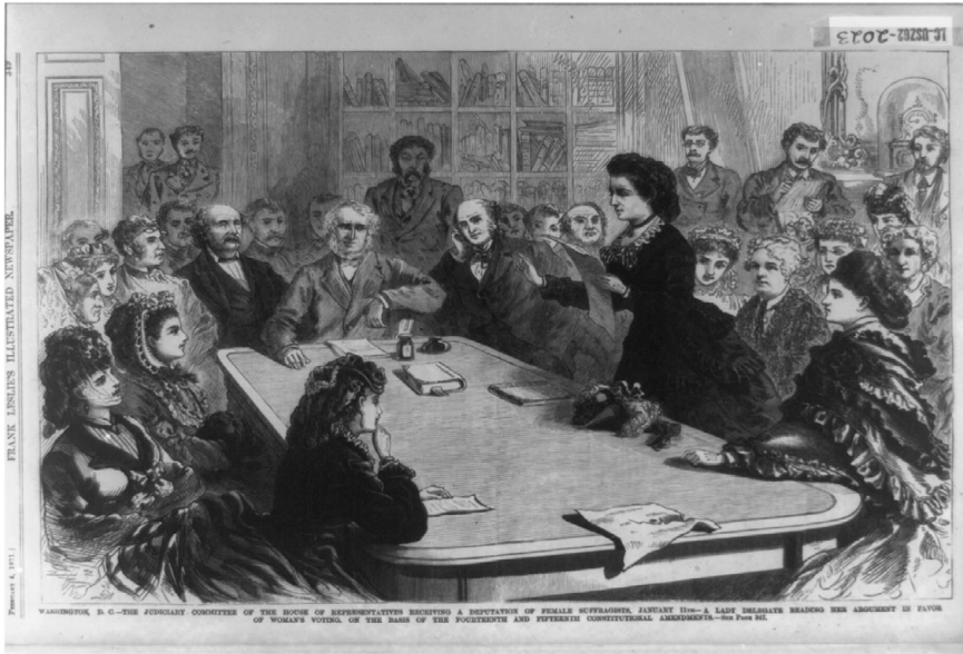
Figure 6. "Washington, D.C. The Judiciary Committee of the House of Representatives receiving a deputation of female suffragists, January 11th – a lady delegate reading her argument in favor of woman's voting, on the basis of the Fourteenth and Fifteenth Constitutional Amendments," Frank Leslie's Illustrated Newspaper , February 4, 1871, Library of Congress Prints and Photographs Division, Washington, D.C. Digital ID: ppmsca 58145 //hdl.loc.gov/loc.pnp/ppmsca.58145

mate, albeit without his knowledge or consent. The pairing of a white woman with a Black man likely sparked popular anxiety about the rise of interracial relationships in the post-Civil War era, and Woodhull's promotion of free love likely only increased that fear. Though she was officially too young to be president, Woodhull's run won more fame for her free love ideology, women's rights activism, and nontraditional gender norms.