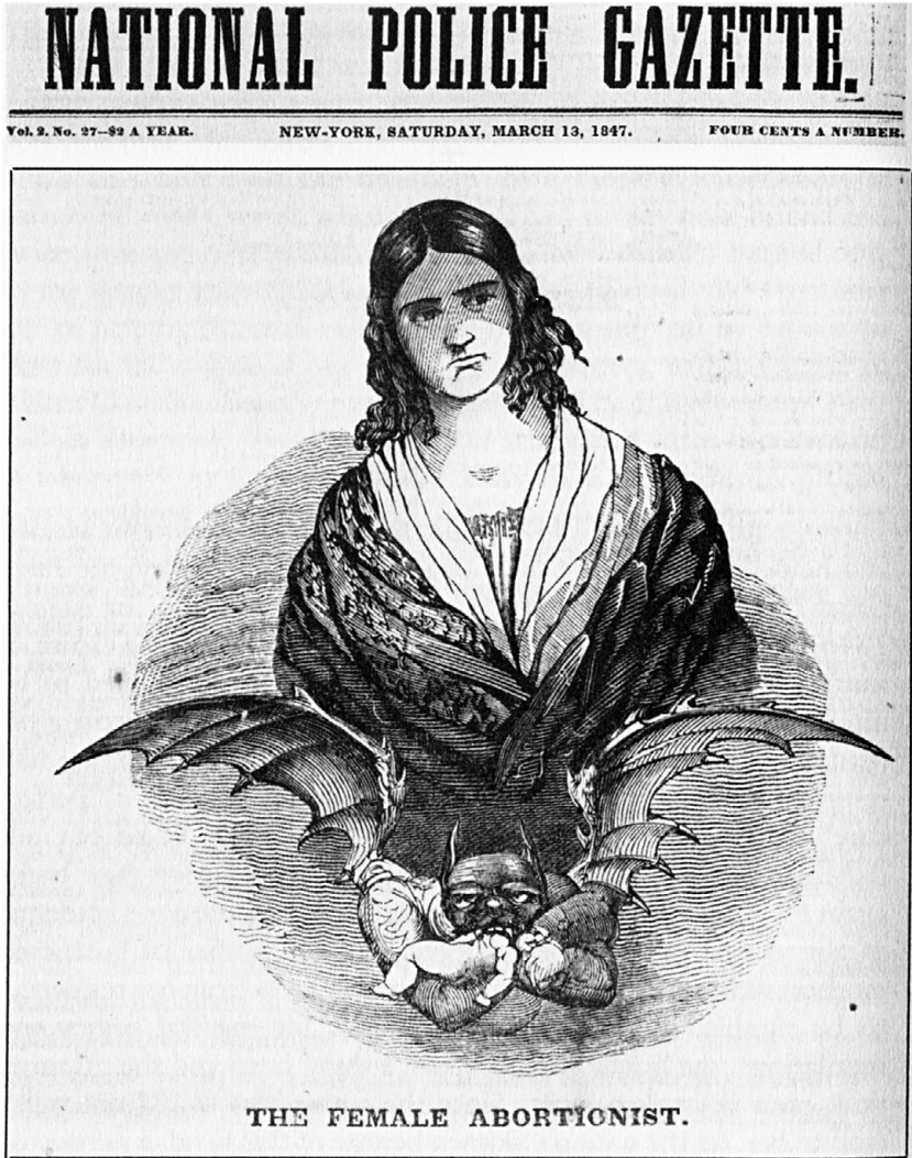
Figure 3. "The Female Abortionist," National Police Gazette , March 13, 1847.

While Nast might have seen Woodhull himself, to make his engraving he most likely viewed or purchased a photographic portrait of her at a local gallery. By the 1870s, photographs of famous figures were widespread, and engravings of them needed to be recognizable. A portrait taken by William Howell might have inspired Nast (Figure 4). Woodhull visited the photographer's New York City studio around 1865 to pose for this relatively traditional portrait. Wearing an elaborately pleated cloak, she looks in the distance and appears to ponder the future, similar to portraits of the day's male leaders. In this near-profile view, her bulky hairstyle stands out, echoing the curve of her ear. If Nast saw this photograph, her centered pair of set curls might have inspired her similarly shaped horns in his cartoon.