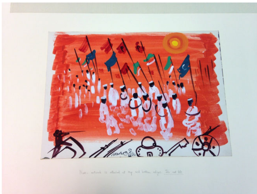
Figure 1. Demonstrators in Calcutta, Gopal Ghose