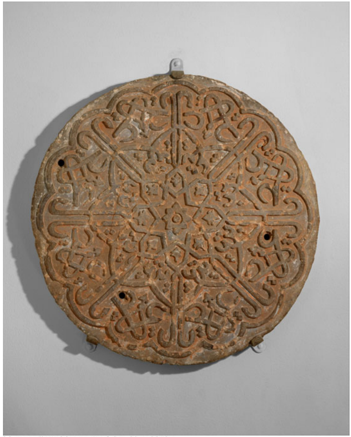
Metropolitan Museum of Art, New York.

Figure 3. Calligraphic Roundel. c. late sixteenth, early seventeenth centuries. Sandstone and pigment, 1 3/16 in. high x 18 1/2 in. diameter.