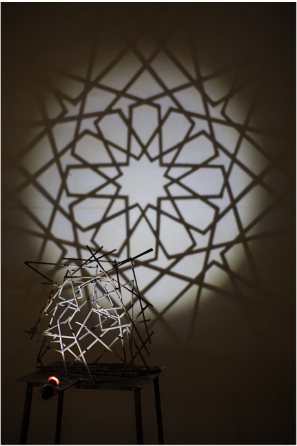
Rashad Alakbarov

Figure 5. Rashad Alakbarov, Shebeke (2017). Welded iron and spotlight. Installation view at YAY Gallery, Baku.