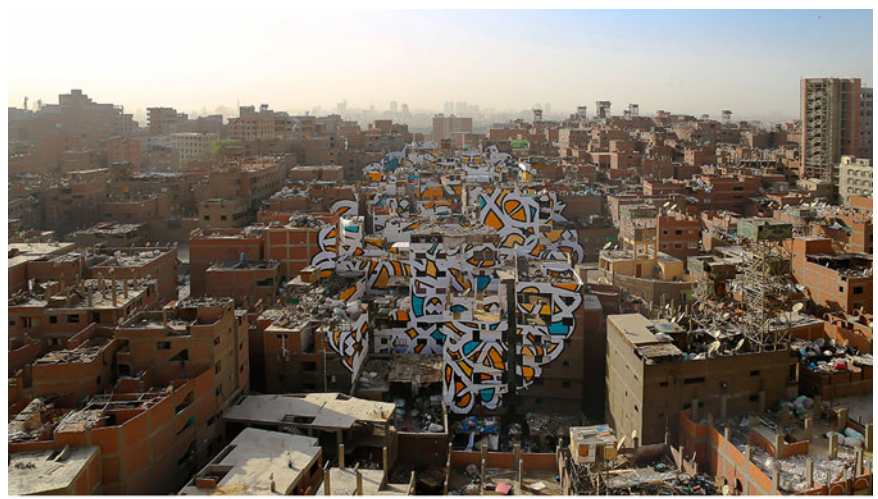
eL Seed, courtesy of Creative Commons.

The exhibition was not only about abstractionists looking to the traditions of calligraphy, but also about contemporary artists in the Middle East looking to abstractionism, both East and West. For one thing, these contemporaries share with the artists of the Islamic world an interest in loosening art practices like calligraphy from their utilitarian ends, which, in the case of calligraphy, is to represent a text with precision and clarity, to expand their use for artistic ends. In Perception (2016), for example, the Tunisian-French artist eL Seed stencilled a calligraphic rondel across the façades of approximately fifty stacked houses in a marginalized Coptic neighbourhood of Cairo [Figure 4].