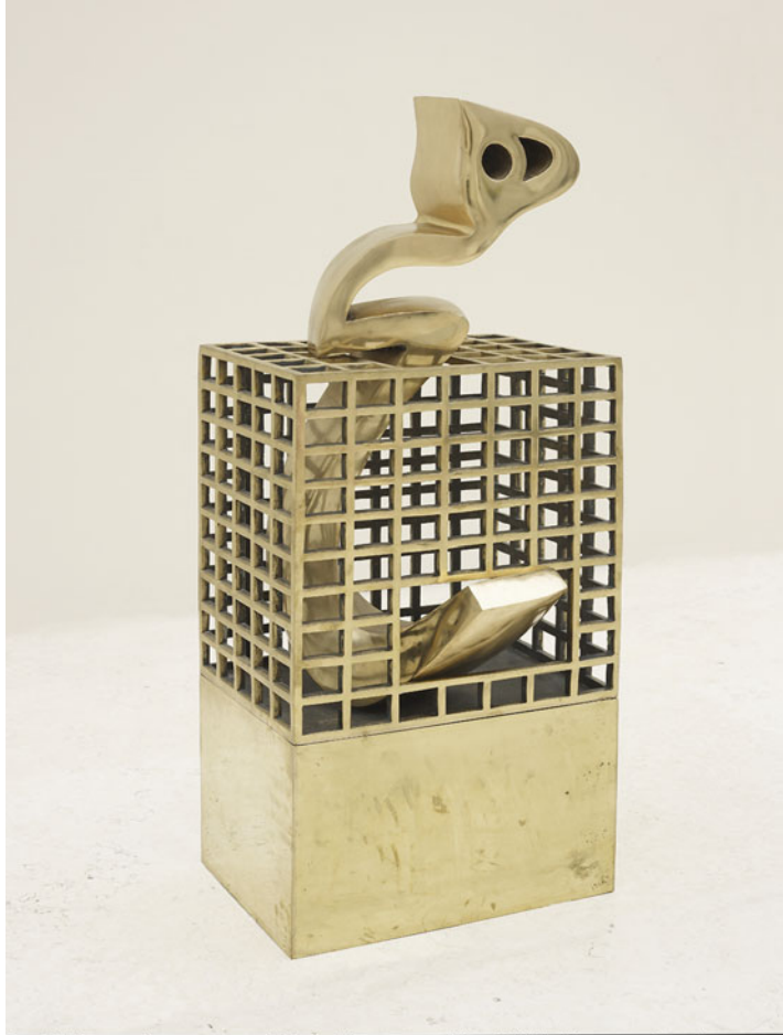
Parviz Tanavoli, courtesy of © The Trustees of the British Museum, London.

Figure 6. Parviz Tanavoli, Heech in a Cage (2005). Cast bronze, 118 cm. high x 49 cm. wide x 42 cm. deep.