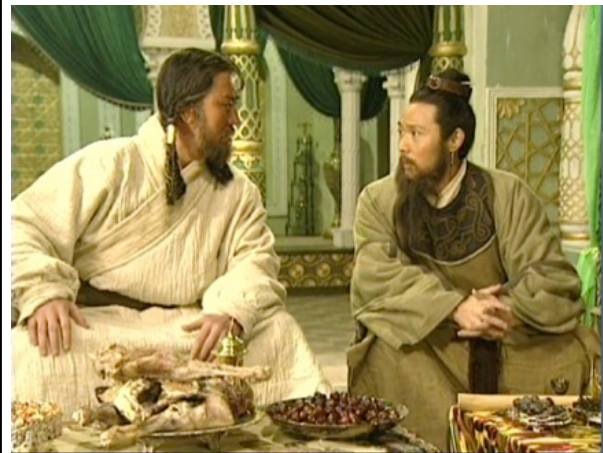
Figure 10. Yelü Chucai advising Chinggis Khan in Chengjisi Han (2004).

Daoist sage. 109 These men imbue in Temüjin an appreciation for the value of learning and scholarship for administering an empire, with particular attention to the three great teachings of China: Confucianism, Buddhism, and Daoism.