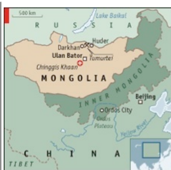
Fig. 7. Map of the country of Mongolia and Inner Mongolia, autonomous region of the People's Republic of China ( The Economist ).

Mongolia itself had become divided in 1911, with the Northern part of Mongolia or Outer Mongolia breaking away from China and maintaining an autonomous state for eight years under the Buddhist lama Bogd Khan, 75 while the Southern part of Mongolia or Inner Mongolia remained under Chinese sovereignty.