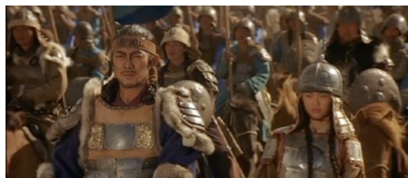
Fig. 6. Chinggis Khan and Khulan ride together into battle in The Blue Wolf : From the End of the Earth and Sea (2007).

Just as Börte is portrayed as a heroic figure in Mongol , Khulan, one of Chinggis' actual concubines, is reinvented in The Blue Wolf as a woman warrior who, after Temüjin defeats her in combat, chooses death over suffering the shame of rape. Temüjin, impressed with her courage, recruits her as one of his warriors to ride beside him into battle. Khulan eventually gives herself to Temüjin voluntarily. Just as Börte in Mongol saves Temüjin twice, so too does Khulan in The Blue Wolf , first by killing a would-be assassin and then by sucking poison from an arrow wound inflicted upon Temüjin. As with Bodrov's treatment of Börte in Mongol , the framing of Khulan's narrative in The Blue Wolf puts an emphasis on female agency, and humanizes the figure of the conqueror.