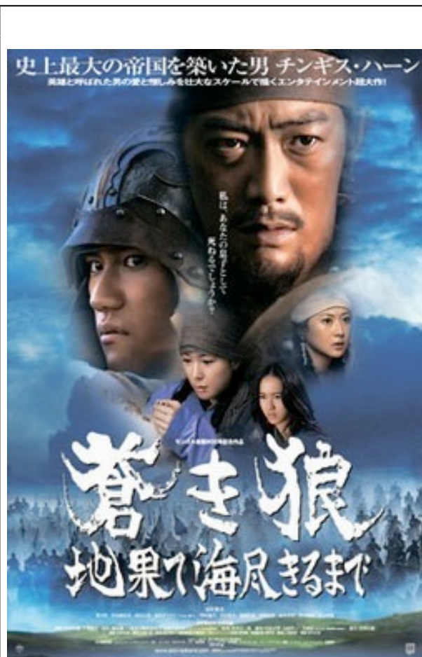
Figure 4. The Blue Wolf: From the End of the Earth and Sea (directed by Sawa Shinichirō, 2007).

While The Blue Wolf was billed as a Japan-Mongolia co-production shot on location in Mongolia over a four-month period in 2006, Mongolians were no happier with it than they were with Bodrov's Mongol . The Blue Wolf was the personal project of co-producer Kadokawa Haruki, a publisher and film director who had conceived of a movie project on Chinggis Khan 27 years before it finally came to fruition.