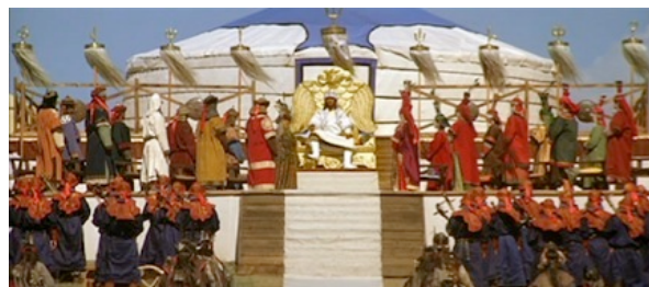
Figure 5. Coronation of Chinggis Khan in 1206, as recreated in The Blue Wolf: To the Ends of the Land and Sea (2007).

Army soldiers, along with local support staff, and they made up the main form of Mongolian participation. 55 It is fair to say that The Blue Wolf is more representative of Japanese fascination with Chinggis Khan and of a Japanese re-imagining of his life story, than of a Mongol perspective.