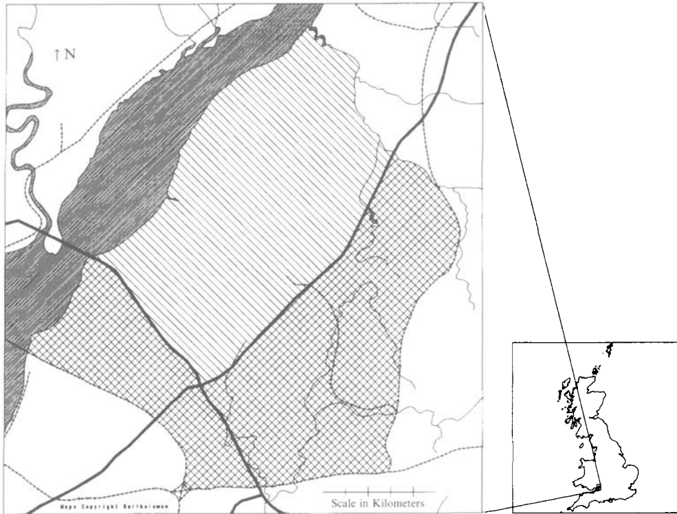
Fig. 1. Intervention (▨) and comparison (▩) areas, with tidal estuary (⊞), motorways —, railways - - - , and major rivers ~.